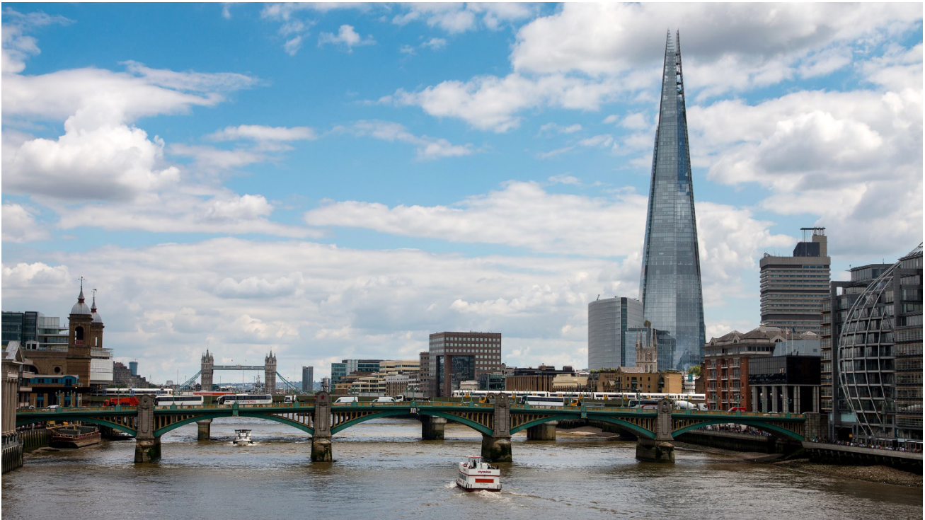
Figure 4. The Shard, London.

a cardinal virtue even though it barely stands up to a reality check—generally speaking, the taller a building is, the more its densification potential and resource efficiency decline, mainly due to safety, distance, and zoning regulations. This was clearly pointed out by a commission engaged by the British parliament as early as 2002 about the planned towers in London (House of Commons, Transport, Local Government and the Regions Committee, 2002). Significantly, municipal and planning authorities have also justified the push for vertical construction with the argument that tall buildings are “appropriate” to the appearance and representation of London (Tavernor, 2004). Such justifications, which relate to symbolic and aesthetic criteria, have typically involved the use of metaphorical language which draws parallels between structural verticalization and figurative vertical aspirations and emphasizes London’s supremacy as a world metropolis in Europe. In a political position paper, for example, former mayor Ken Livingstone advocated high-rise construction in London as follows: “London must continue to grow and maintain its global pre-eminence in Europe. London must continue to reach for the skies” (Greater London Authority, 2001, p. 4).