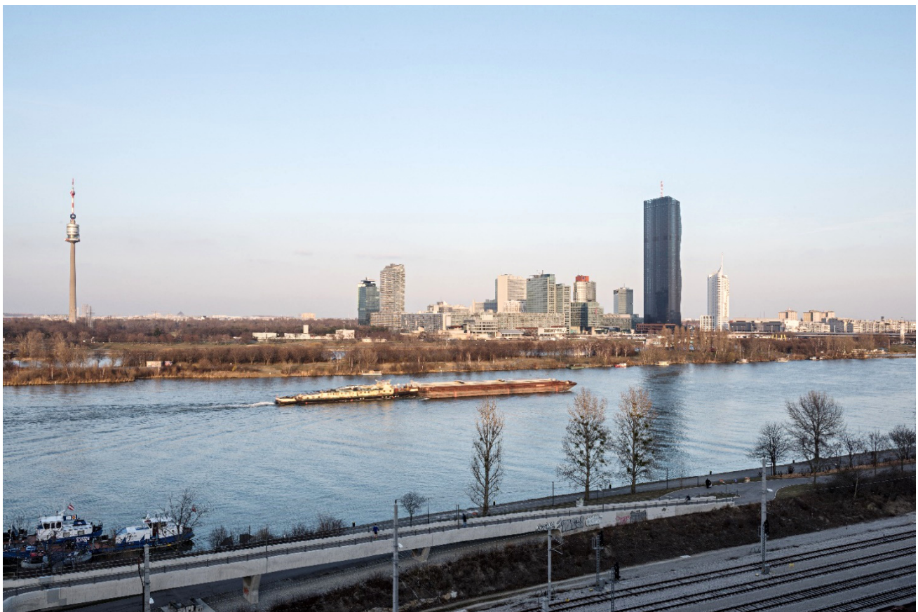
Figure 5. Donau City, Vienna.

The approach in Vienna also has specific features in terms of observational patterns, comparative practices, and shorthand descriptions of the city. While in London and Paris, specific individual metropolises determine