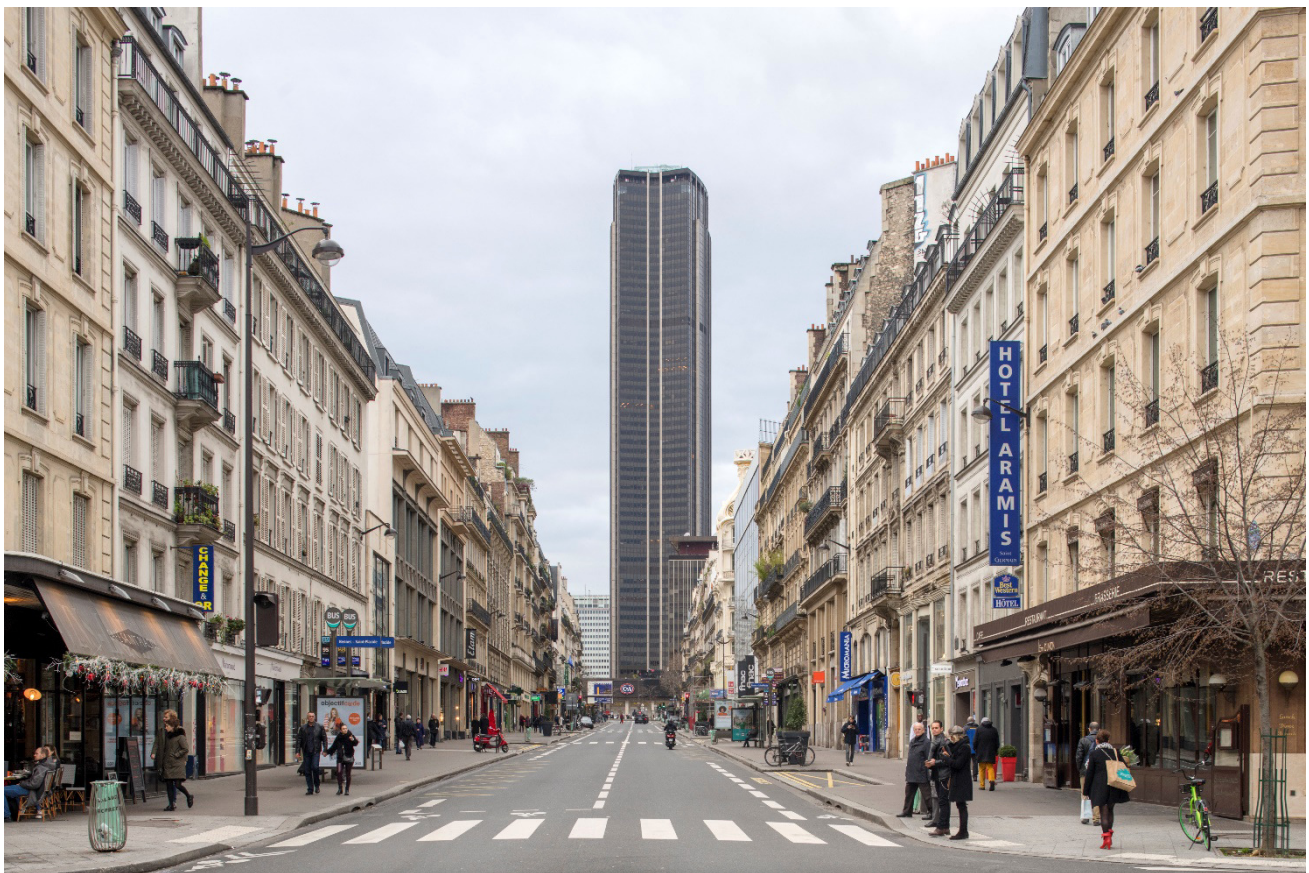
Figure 1. Tour Montparnasse, Paris.