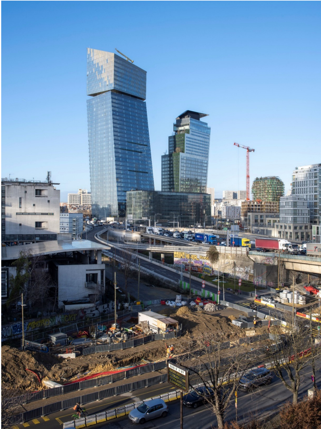
Figure 2. Tours Duo, Paris.

courthouse in the Clichy-Batignolles district; the architects Herzog & de Meuron are behind the design of the Triangle building to be erected at the Porte de Versailles exhibition center; and the Atelier Jean Nouvel designed the Tours Duo 1 & 2 built in the Masséna-Bruneseau quarter (Figure 2). It is no coincidence that all of these architects have made a name for themselves primarily through the design of museums or concert halls and have a comparatively “artistic” image (Foster, 2011; Gravari-Barbas, 2020).