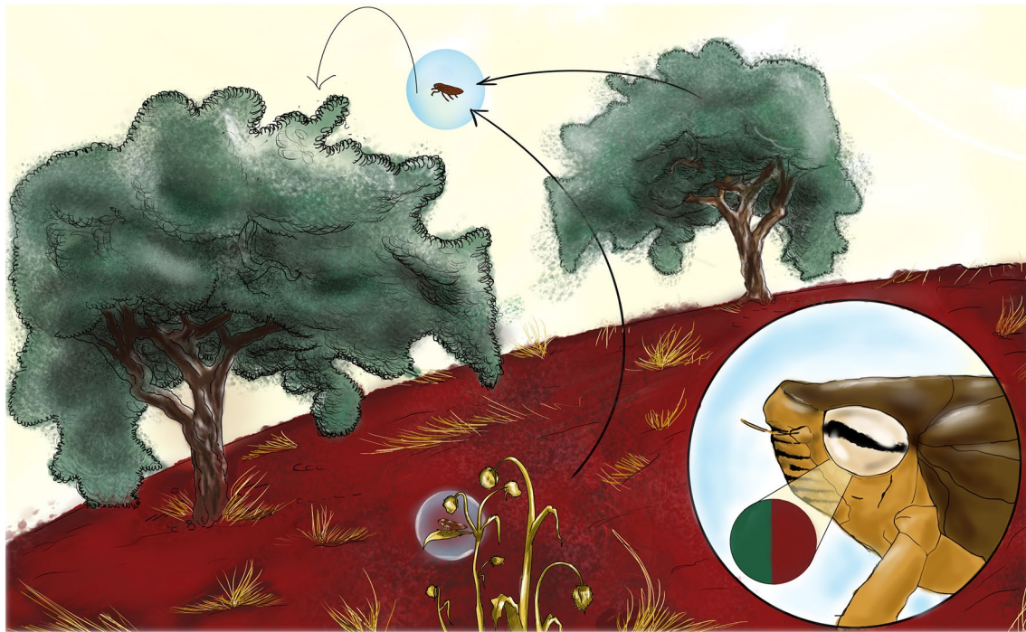
Fig. 1 Visual cues may govern the movement of the spittlebug Philaenus spumarius toward olive plants, considering contrast of colors between the red bare soil and the green olive canopy. The spit-

tlebug may move from the drying herbaceous vegetation or from surrounding olive/wild trees