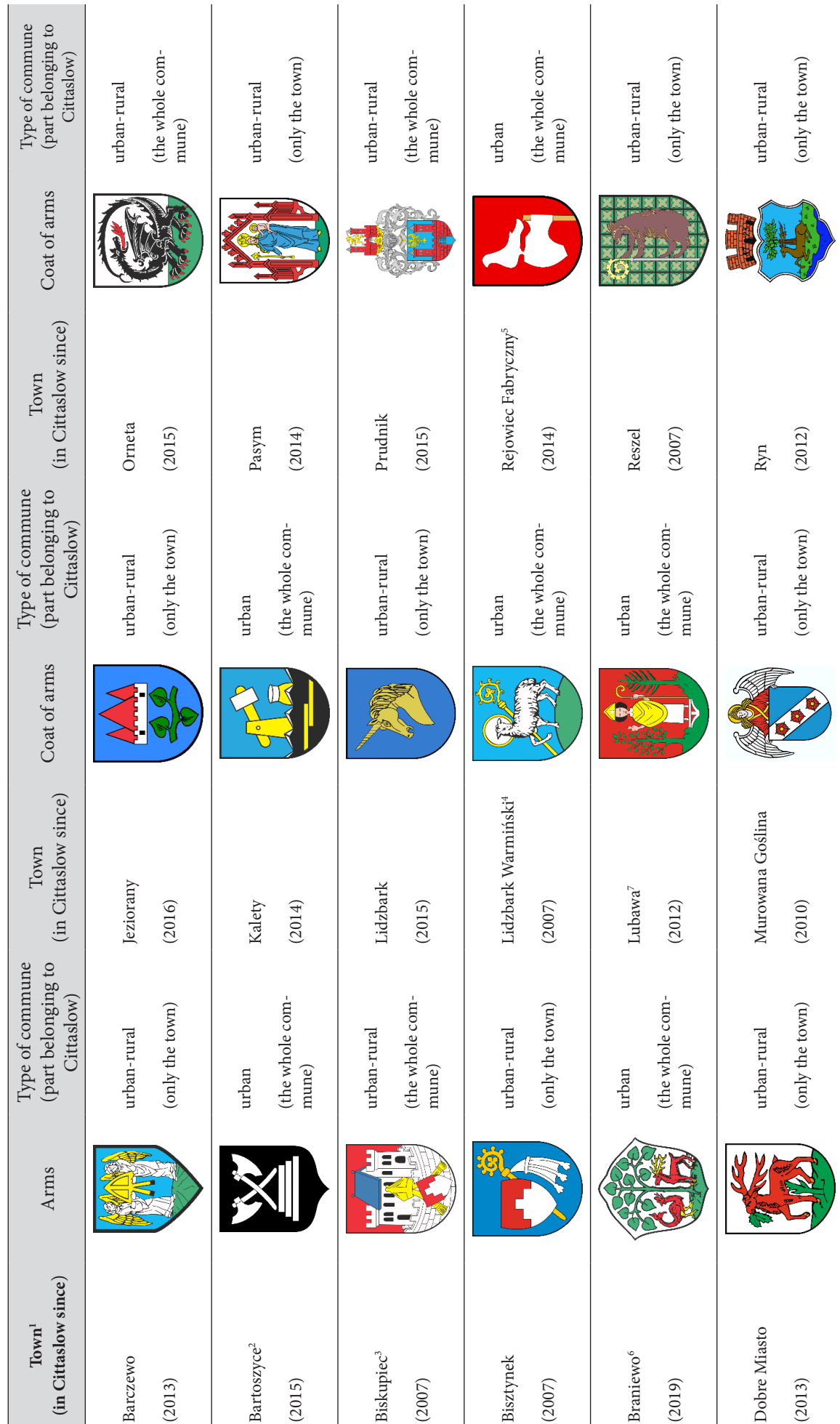
Table 1. Basic information regarding Polish Cittaslow towns (Author's own study)