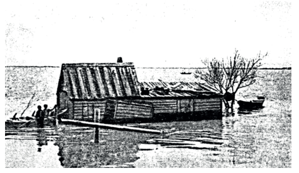
Figure 2 . Spring floods of the Don River near Rostov (after N.P. Puzyrevsky, 1910).

period did not reveal such large variations as in the former. N.P. Puzyrevsky notes that «[...] the curves of discharges and velocities determined in these two periods coincide with low water levels quite accurately. For high water levels, the discharges determined in the latter period are relatively larger and this indicates certain changes in the river channel, its slopes and can be explained by intensive dredging works conducted in the period of 1896–1907».