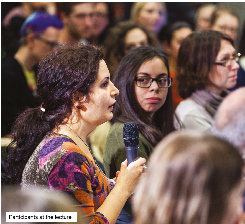
Participants at the lecture