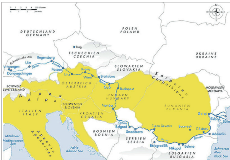
FIGURE 1 – Participating partner countries

UP and PHT will play a key role in the field of education and pedagogy while the IPCH will be engaged in the cultural heritage promotion and information to the public of the importance of preserving it; UNIVE and UAB, due to their research activities concern aspect of conservation of CH, will provide expertise in the field of preservation and restoration of TCH while the HOAM is nowadays one of the most important museum which deals with the transmission of ICH; UNIFE and ZSEM are involved because of their research in the field of ICT tools. Finally, High schools network will be selected during the project inside the participating countries.