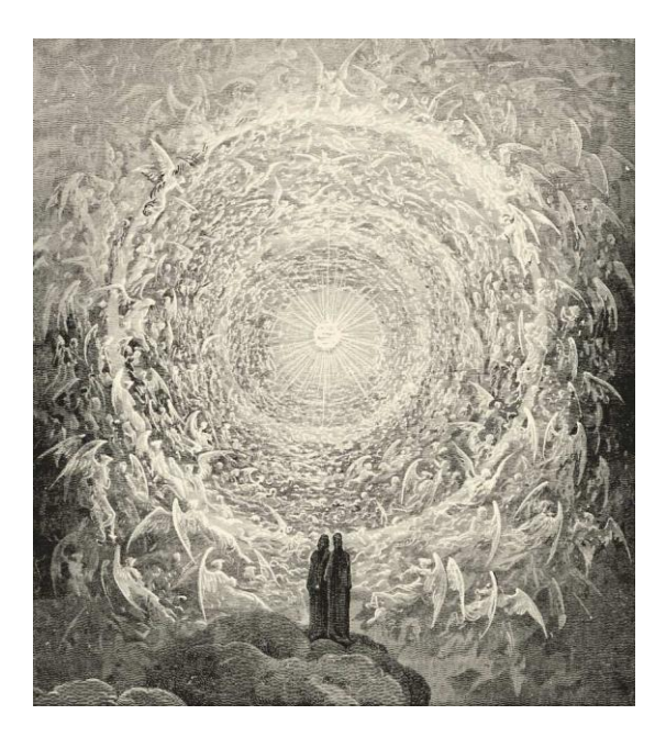
Fig. 3. Paul Gustave Doré, Empyrean Dante, Paradiso, Canto 31.

To talk about Anders Endzeit und Zeitenende ,<sup>49</sup> we need Nietzsche's eternity in fact as this is the moment, the now. Again and as already intimated at the start, this is mapped out in space, a space of infinite dimension, fore and aft, as Nietzsche depicts it and without which dimensionality it is impossible to think the Augenblick as Nietzsche also names the moment. Time stands still and in what Nietzsche could describe as two roads, mapping infinities past and future, the crossover, the junction is the moment, Augenblick ,<sup>50</sup> the same word Adorno uses.