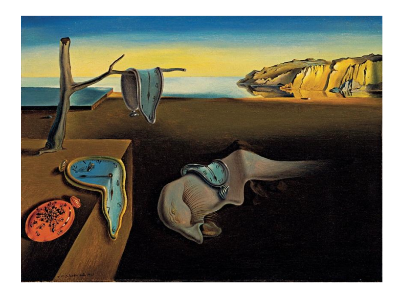
Fig. 2. Salvador Dali. The Persistence of Memory. 1931. Oil on canvas.