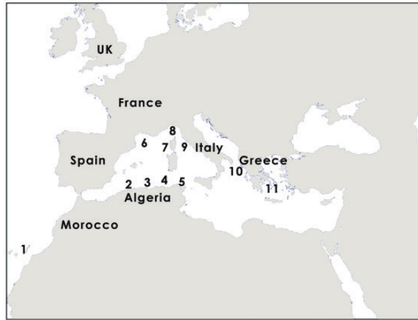
Figure 1. Map of sampling locations of bogues (1: Tenerife Island, 2: Gulf of Oran, 3: Gulf of Bejaia, 4: Gulf of Annaba, 5: Gulf of Tunis, 6: Gulf of Lions, 7: Corsica Island, 8: Ligurian Sea, 9: Tyrrhenian Sea, 10: Ionian Sea, 11: Aegean Sea).

Sea (MEDITS surveys), on board fishing vessels and from fish markets. The sex of the sampled individuals was determined by macroscopic examination of their gonads and only mature fish were included in this study to minimize the effect of sexual maturity, which may affect otolith shape (Cardinale et al. , 2004). Moreover, to limit the effect of age on the otolith shape, the age range of fish sampled was limited from 2 to 4 years. To estimate the age of each individual, whole sagittal otoliths were examined, after cleaning, by two expert age readers to limit interpretation errors. To increase the visibility of the growth marks, otoliths were covered with clove essential oil and observed with a stereomicroscope under reflected light on a dark background.