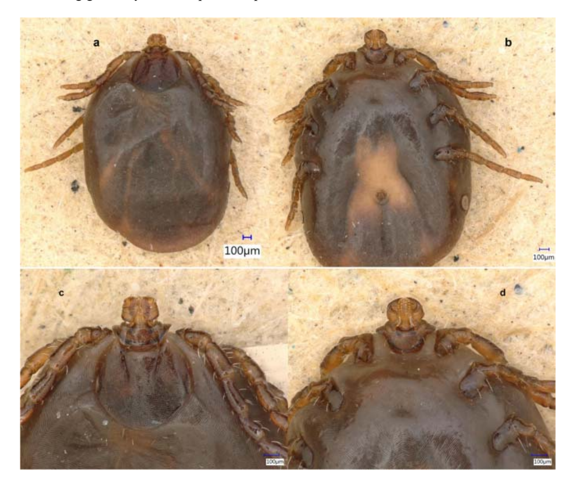
Fig. 1. A nymph of Rhipicephalus maculatus parasitizing a German tourist with a prior trip to South Africa: a dorsal view, b ventral view, c scutum and capitulum dorsal, and d capitulum ventral

The analysis of the morphology of the nymph (Fig. 1a, b, c, d) revealed the following characteristics: scutum wider than long (0.675 mm width, 0.527 mm long); posterior margin a broad deep curve; cervical pits deep, convergent, continuous with the shallow; eyes at the widest point, prominent; basis capituli over three times broad as long (0.395 mm width, 0.128 mm long), the widest anteriorly where the exceptionally long sharp lateral angles project sideways over the scapulae, ventrally small bulges represent the ventral spurs and long setae. Hypostome spatulate, dental formula 2/2. Coxae I each with a long sharp external spur and a shorter broader internal spurs; coxae II to IV each with an external spur, decreasing gradually in size. Spiracular plate round.