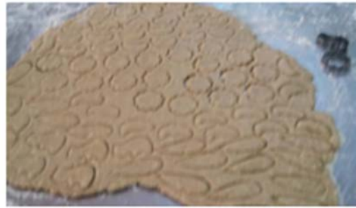
(b) cookie dough