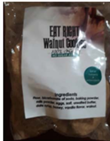
(d) Packed walnut cookies