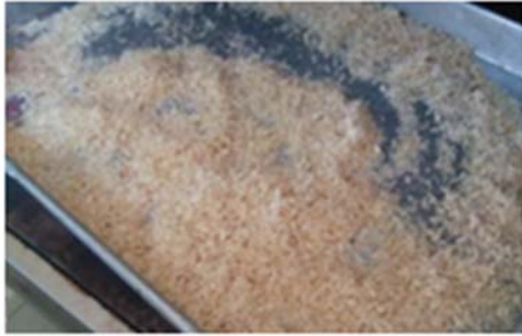
(a) Shredded walnut