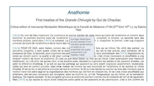
Figure 4: Detail of the on-line edition of GuiChaulMT with the display of the sense definition of traitier m.