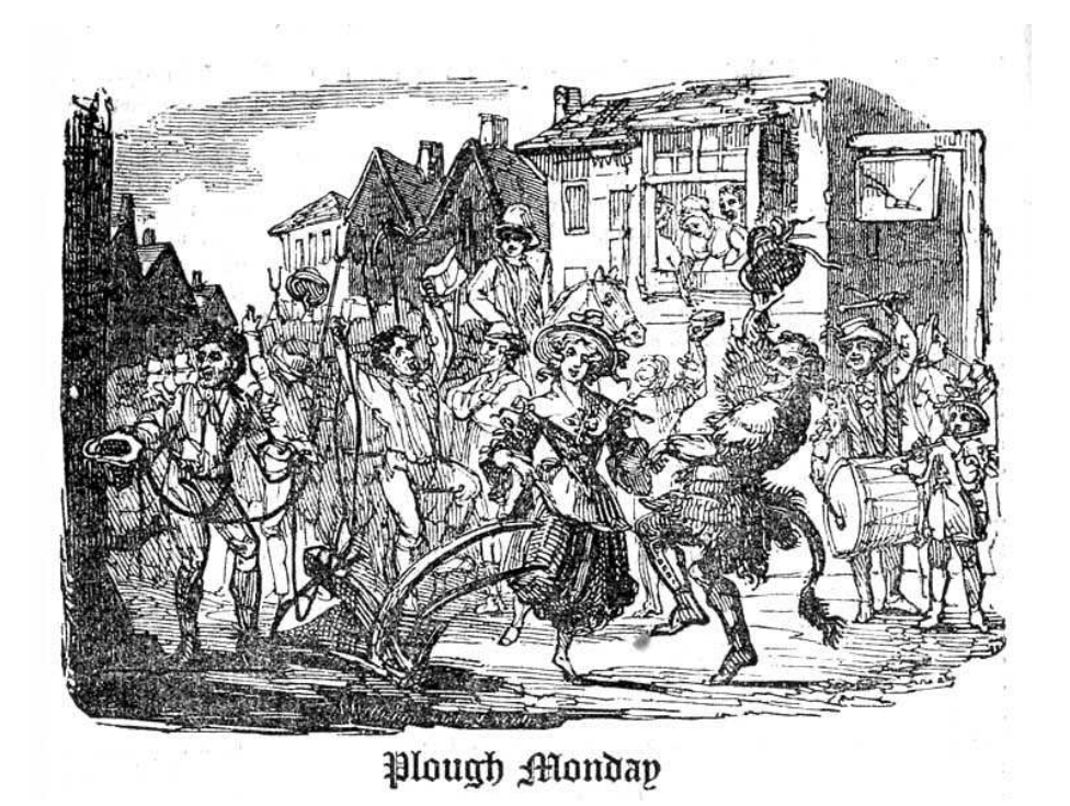
PLATE 1. A Regency view of Plough Monday celebrations.

Young fellows calling themselves 'plough bullocks,' their faces either blackened or covered with red ochre, went about the streets and yards of old Nottingham collecting money for drink and spending it at public houses as they received it. Their only claim to be ploughmen rested in the collector, who wore an old smock-frock and carried a waggonet's lantern at night.