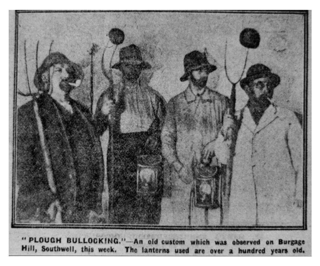
PLATE 2. A non-play Plough Monday Custom : Plough Bullocks from Southwell.

The photograph shows four men of uncertain age dressed in agricultural fashion with pitchforks, slouch hats and clay pipes, etc. At least three appear to have beards, although they may be artificial, and one or perhaps two seem to have darkened faces. Two are carrying old waggoners' lanterns, one of whom appears to be wearing a smock-frock and the other a dairyman's white coat. Two of the pitchforks bear objects that look like swedes or mangels which are probably face lanterns, for which there is a precedent at Ruddington. (Nottinghamshire Archives, 1960, DD121/58).