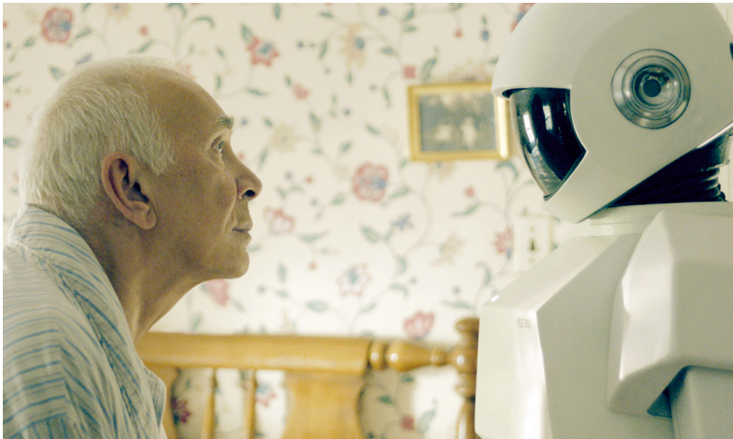
FIG. 7. FRANK AND ROBOT, FACE TO FACE

advanced simulation.” This scene is a fascinating visual and narrative climax to the film’s posthuman scenario. Shot in a series of increasing close-ups, the scene involves a moment of human/machine intimacy and convergence that implies a breach of multiple boundaries and culminates in a close-up of Robot and Frank in profile facing one another (see fig. 7). This image is important narratively and symbolically, as well as promotionally—the profile shot is the most common image used in the film’s marketing. In place of a face, Robot has a mirrored visor that reflects Frank to himself, a metaphoric substitution (a mirror in place of a face) that signifies his programmed selflessness and servitude. The scene is an enactment of this selflessness: Robot insists that Frank “wipe” his memory to save himself from prison. Robot bows his head, a gesture of subservience and submission, which also bears traces of trust, affection, benediction. Frank must wrap his arm around Robot to reach the deactivation switch at his back, resulting in a human/machine embrace that draws attention to Robot’s materiality, the vulnerability of his embodiment (see fig. 8). The film cuts to an extreme close-up of Frank’s hand on the button that will erase Robot’s memory, further emphasizing