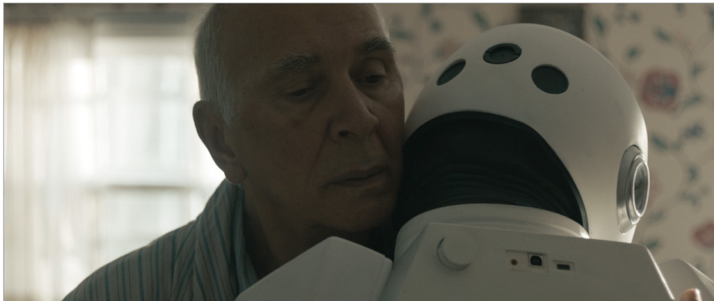
FIG. 8. HAPTIC INTIMACY BETWEEN HUMAN AND MACHINE EXPOSES THE VULNERABILITY OF EMBODIMENT

the pair's haptic intimacy. This close attention to these fragmented bodies—Frank's hand, Robot's operational console—suggests haptic convergence between human and machine, organic and synthetic, old and new, worn skin and smooth surface.