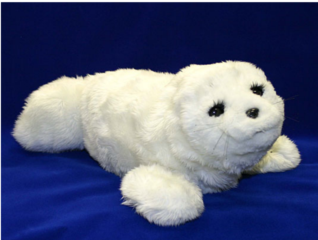
FIG. 2. PARO