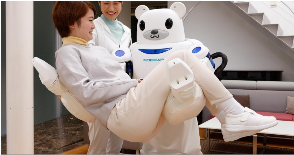
FIG. 1. ROBEAR