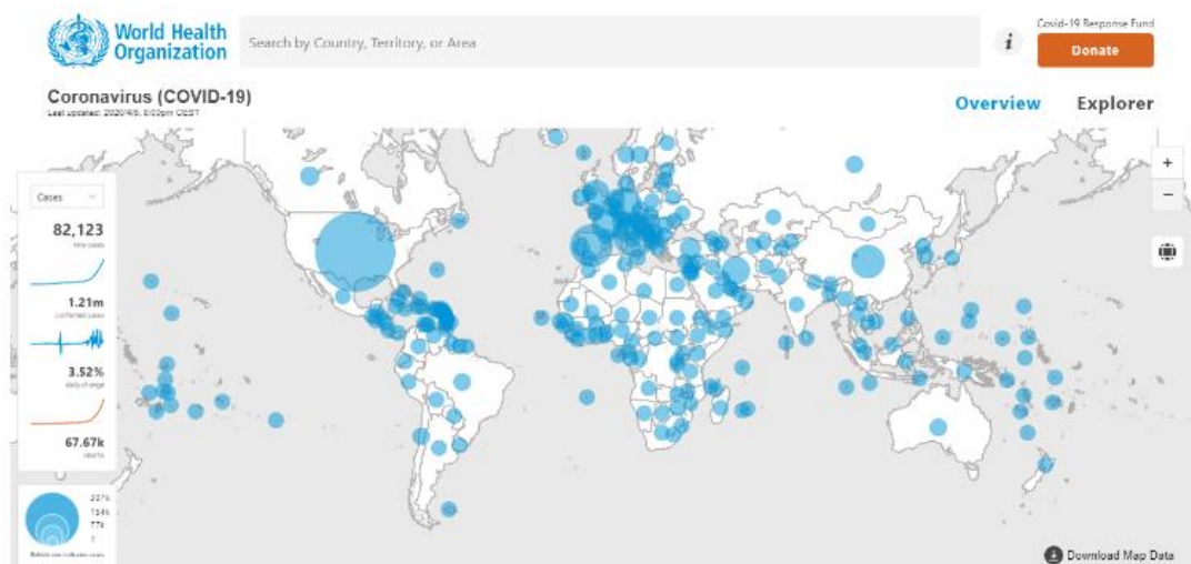
Figure 1. Current global situation of Coronavirus cases – screenshot after https://who.maps.arcgis.com/home/index.html , July 10 th , 2022

statistical data provided by the WHO worldwide for Europe, for example, a percentage of 46.0% of illnesses and 63.0% of deaths were provided. Most cases were recorded in Spain, Italy, Great Britain, Germany and France (Kluge, 2020). It is estimated that the actual number of cases of infection is 4 times higher worldwide than the number of diagnosed cases, but this number varies from country to country (Bohk-Ewald et al., 2020). The National Institute of Public Health, on July 10 th , 2022, publishes the global situation of those who have fallen ill with Covid-19. Thus, it can be noticed that there are 560,194,870 confirmed cases of Coronavirus infection (Figure 1) of which 6,372,358 deaths.