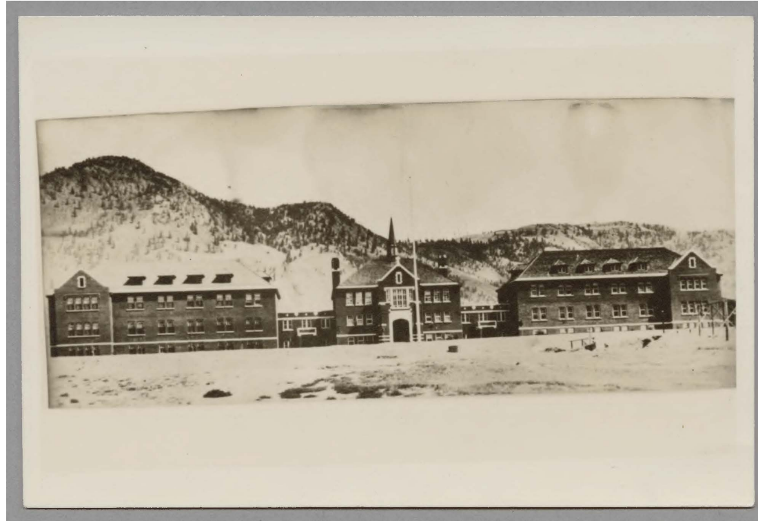
View of Kamloops Indian Residential School, date unknown

Today, the redbrick buildings are still standing on the Tk'emlúps te Secwépemc First Nation's land. You can still look through the glass windows and see the old classrooms and halls. You can walk the grounds, toward the site of the former orchard or the banks of the nearby river. And you can stand over the graves of