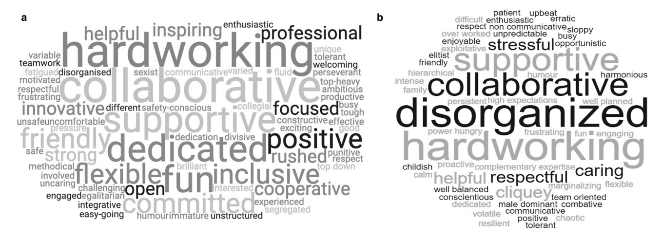
Figure 4. Word clouds describing perceptions of field team work culture from ITGC post-field season surveys reflecting the (a) 2019–20 and (b) 2021–22 seasons. The size of a word in the word cloud is proportional to the number of times the word appears in the input text from the surveys.

contractors, and scientists, which can assist with improving experiences and science outcomes, and (iv) the 'Community Norms and Values' and 'Field and Ship Best Practices' documents. When asked how supporting agencies can improve future field seasons, team members gave answers such as 'better communication', 'improve coordination between co-leaders', 'additional meetings for team building', and 'explain the role of different agencies involved.'