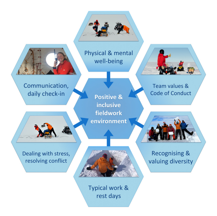
Figure 3. Visual representation of important topics covered during the ITGC facilitated pre-field season conversations to build a positive and inclusive field work culture.

social interaction tools to promote personal and introspective discussions between team members with respect to work-life balance, conflict recognition and resolution, and prospective roles and hierarchies in the field.