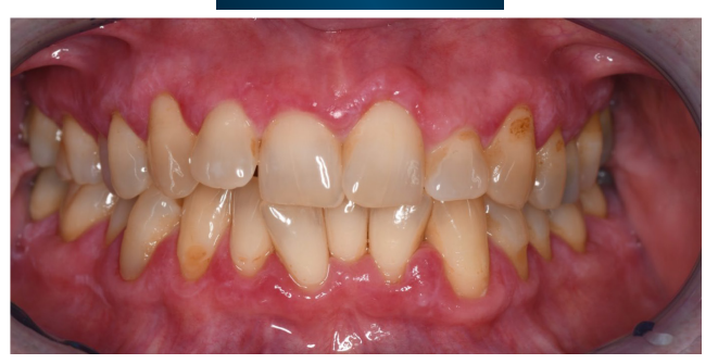
FIGURE 10 Clinical frontal view of a young female patient with generalized oral lichen planus lesions.