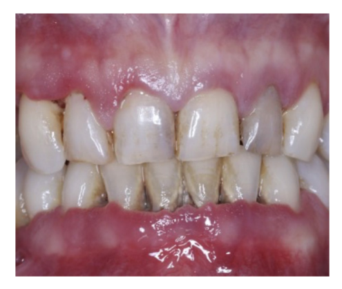
FIGURE 9 Clinical evidence of necrotizing periodontitis in the upper and lower anterior areas with presence of supragingival biofilm, calculus, and interproximal periodontal tissue destruction.

and with calcium channel blocker medication<sup>57</sup>; however, it can also be of genetic origin and is then called hereditary gingival fibromatosis (HGF). HGF can occur as an isolated phenomenon or as part of a syndrome including hypertrichosis, mental retardation, epilepsy, growth retardation, and abnormalities of the extremities.<sup>58</sup> HGF presents with progressive slow, non-hemorrhagic, fibrous, albeit painless growth of the gingival tissue and affects approximately 1 in 750,000 live births.<sup>59</sup> Hitherto the disorder has been mapped to five candidate genes including the Son of Sevenless genes, REST, ZnF862, Alk, and CD36.<sup>60-62</sup> One of the main pathogenic mechanisms results in an excessive secretion of transforming growth factor- (TGF) \beta and an extensive production of extracellular matrix proteins which clinically manifests as more or less severe enlargement of the gingiva; in severe cases, major parts of the tooth surface might be covered.<sup>63</sup>