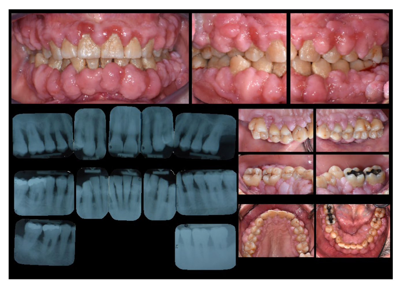
FIGURE 13 Periodontal disease and massive gingival hyperplasia in a patient diagnosed with acquired neutropenia, polyneuropathy, Cushing-syndrome, glomerulonephritis, and hypertensive heart valve disease. The 58-year-old patient took immunosuppressants and calcium antagonists. Periodontal therapy was performed after consultation with the hematologist.

Diabetes mellitus (DM) refers to a group of disorders affecting the insulin-glucose system resulting in chronic hyperglycemia. It is one of the most important global health threats of the 21th century with significantly growing numbers over the past 20 years. According to the World Health Organizataion (WHO) an estimated 422 million people globally suffer from DM<sup>122</sup> mainly type II. An insulindependent (type I) (Figure 14) and a non-insulin-dependent (type II)