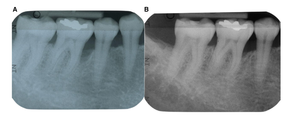
FIGURE 2 A, Radiographic scenario of an infrabony defect on the mesial aspect of tooth 46. B, Periapical radiograph at the 12-month follow-up examination following non-surgical mechanical instrumentation documenting radiographic bone fill.