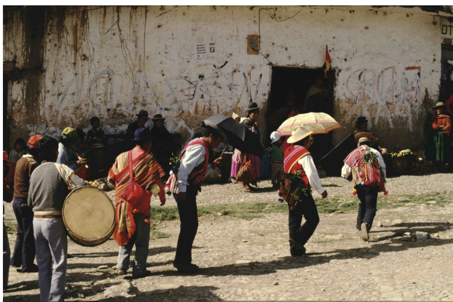
Figure 3. Men from Curva performing the Kallahuaya dance during a feast in Chrazani in 1987.

The instrumentalist conception matched well with the ideology of the young Bolivian nation-state (founded in 1825), a new framework for the old ethnic diversity now dressed up as folklore. The development is reflected in Melchor María Mercado's (1816-1871) paintings (created 1841-1868), among them the representation of a dancing Callaguaya ([sic]; Rivera, 1997, lámina 38). The image shows a male person with braided hair, wearing a bowler hat, and showing two Kallawayaya characteristics: the bag used to transport precious medical plants and paraphernalia, and the parasol shown until recently in dances at feasts in Charazani (Fischer, 2008, 196; Figure 3) which differ widely from current representations (SmithsonianNMAI, 2017).