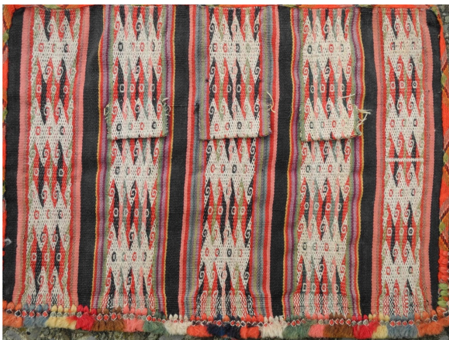
Figure 1. Kurti -design in a Kallawaya early twentieth century bag.

Before the zigzag-design called kurti (Qu.), meaning "those appointed by lightning" (Figure 1; Lara, 1978, p. 109; Wrigley, 1917, pp. 191-220) appeared in the naturopaths' clothing woven by their spouses on traditional horizontal looms, it had to be turned into a figure of memory in Assmann's sense (2000). The material quality of lightning had to be deliberated and transformed into a formal, a figurative language. Despite of the broad spectrum of zig-zag variations, this specific form called kurti is exclusively related to Kallawaya professionalism. Photographs dating to the mid-nineteenth century show bags with fine designs and ponchos with ikat stripes comparable to the kurti -design (Girault, 1969).