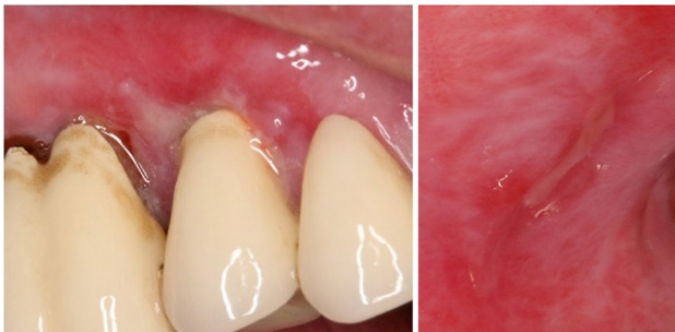
Fig. 4 Clinical example for a relevant medication-related finding. Patient reports recurring painful mucosal lesions and aphthae. Histological examination of two biopsies showed a chronic ulcer and chronic gingivitis (without any evidence of malignancy). Medical history revealed that the patient is taking the angiotensin-converting-enzyme (ACE) inhibitor ramipril, which has oral ulcers, aphthae, and aphthous stomatitis as known side effects

2 100% = 687 patients, multiple entries per patient were possible. Five hundred forty-three patients (79.0%) exhibited no medication-related finding. Ninety-four patients (13.7%) had one relevant finding, 36 patients (5.2%) had two, 10 patients (1.5%) three, 3 patients (0.4%) four, and one patient (0.1%) five relevant findings