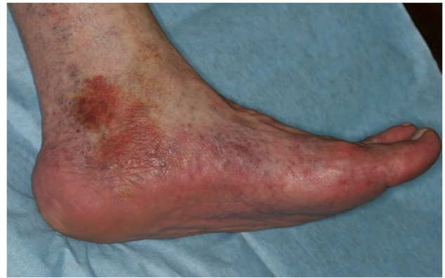
Fig. 3 Clinical example for a relevant finding related to diseases of veins. Patient presents with skin lesions on the feet and suspects adverse effects from dental materials. Referral to dermatologist revealed chronic venous insufficiency