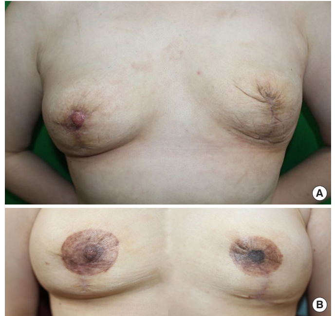
Fig. 3. Clinical photographs. (A) Two months after bilateral breast mound reconstruction. (B) One month after temporary tattooing.

was performed through a vertically designed modified CV flap on the left breast at postoperative 11 months. At postoperative 12 months, inverted nipple repair using the Elsayh method and the purse-string suture technique on the right breast was performed (Fig. 4). Areolar reconstruction with tattooing was also per-