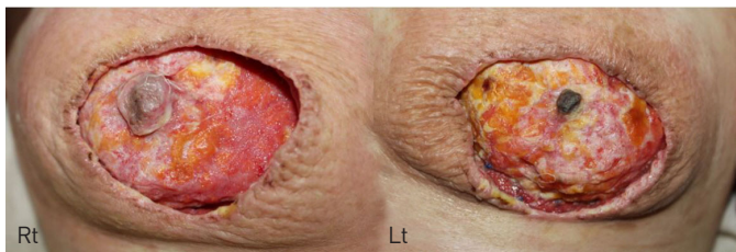
Fig. 1. Initial presentation with severe inflammation on both breasts. A soft tissue defect on the right breast with a partially preserved nipple was observed, while there was a soft tissue defect on the left breast and the nipple had completely necrotized.