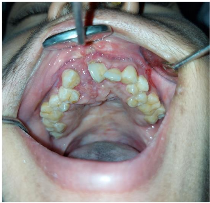
Figure 8 : follow up after 2 months with no sign of infection, hematoma and wound dehiscence

To prevent a superficial hematoma, the wound was covered with a pressure dressing. Ten days' worth of postoperative antibiotics were given as needed. Sutures were taken out ten days after the procedure whereas on the second postoperative day the drain tube was removed. Early ambulation was advised to lessen the amount of discomfort and impairment. Post operative complications were evacuated weekly both on the donor site and recipient site. No sign of infection, hematoma, paresthesia , exposure of the graft , wound dehiscence were noted.