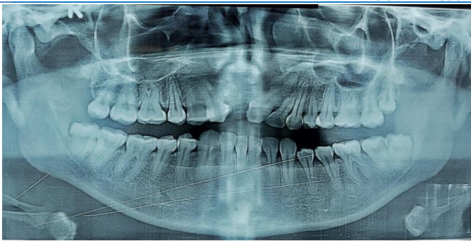
Figure 9 : Post Operative OPG after 2 months of bone grafting DISCUSSION

Some rehabilitation planning is considered here such as Orthodontic treatment after 6 months which includes space correction by arch expansion, correction of Class III malocclusion and correction of rotated and inclined teeth. Le fort 1 osteotomy with maxillary advancement is also considered for the correction of skeletal Class III malocclusion.