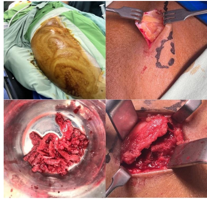
Figure:6 - Collecting cancellous bone from Right iliac crest

After the patient was properly positioned, preparation of donor site with all aseptic precautions by proper draping and painting was done. An incision was made through the skin and periosteum, starting approximately 1.0 cm lateral and inferior to the right anterior iliac spine . The skin was retracted prior to making the incision so that it lay lateral to and beneath the crest instead of over the crest. The superior portion of the incision was then retracted medially and osteotomy on the right iliac crest area to expose the donor site. Collected Cancellous bone from the donor site was placed to the recipient site. Closure of the recipient site followed by closure of the donor site was done layer by layer by securing a drain tube.