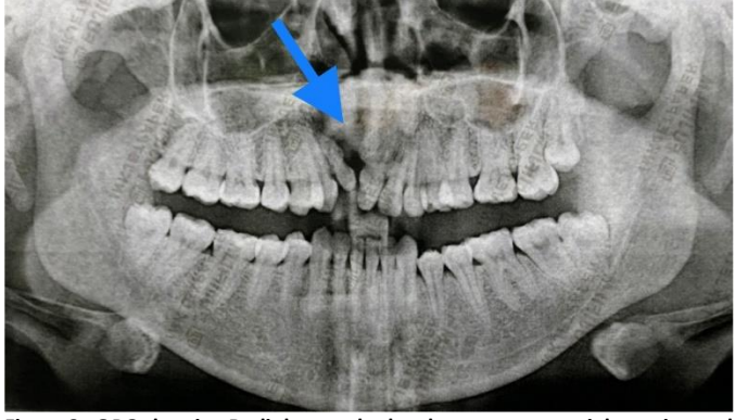
Figure 3 : OPG showing Radiolucent shadow between upper right canine and left central incisor indicating hard tissue defect.