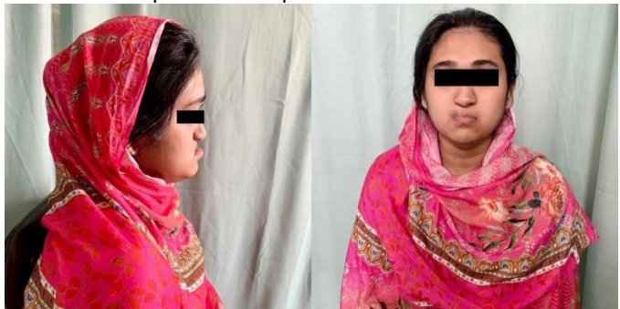
Figure 1: Extra Oral Features of the Patient showing concave profile with anteriorly divergent face

On examination, (Figure-1) patient reveals a concave profile with anteriorly divergent face. Patient has a depressed nasolabial area with increased naso-labial angle. She has a everted and flabby lower lip with short upper lip bearing the scar mark of repaired cleft lip.