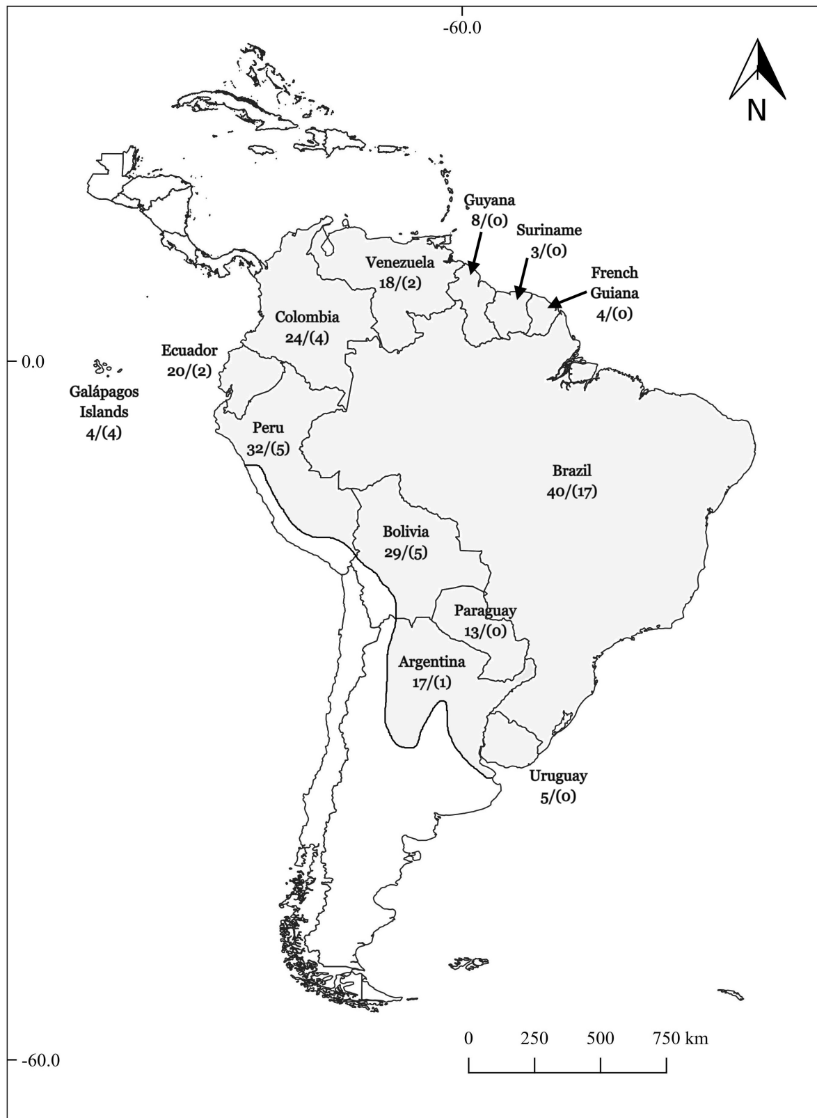
Fig. 2. Number of species of Acalypha L. in South America by country. In brackets: the number of endemic species in each country.