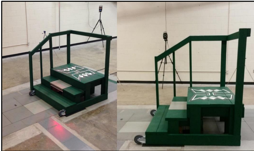
Figure 1. Images of the instrumented stair way and platform.

The staircase consisted of three steps and a handrail with the following dimensions: step rise, 18 cm; step width, 46 cm; step tread, 28 cm; stairway rise angle, 32.73 degrees (Figure 1). Participants were instructed not to use the handrail while performing stair negotiation. If a participant used the handrail, the trial was discarded and recollected. All participants completed five successful trials at a self-selected pace in each loading condition.