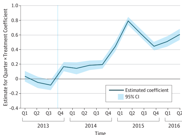
Figure 3. Event-Time Estimates for Minor Injury vs Other Injury Ambulance Dispatches

All SEs (used to calculate 95% CIs) are adjusted for clustering at the dispatch-zone level (31 dispatch zones). Observations are at the call type per zone per month level. The outcome is the count of dispatches. The model includes dispatch zone fixed effects and a control for the dispatch zone population in a given year. The first quarter (Q) of 2013 was omitted. The dashed line indicates the implementation of the Patient Protection and Affordable Care Act.