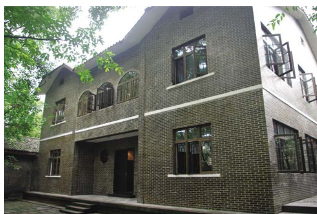
Figures 3 and 4. The compound gate and main building of the former Australian legation at Goose Ridge Hill, Chongqing, 2011, source: Vincent Chang.

The process of restoring wartime heritage in China began in the 1980s, when Beijing's shift away from hard-line socialist ideology created space for local society to revisit its pre-Maoist past. In Chongqing, the ensuing 'new remembering' gave rise to the restoration of former embassies and (spurred by exchanges with Taiwanese officials and scholars) major former Nationalist sites such as Chiang Kai-shek's wartime headquarters. The exhibition there today praises Chiang as an important historical figure, while acknowledging the importance to China's war effort of the 'international anti-fascist alliance'. 10 Pictures of foreign diplomats – including Eggleston – posing with Chiang's officials, are displayed in exhibitions across the city. 11 There is even a local state museum dedicated to the memory of US General Joseph Stilwell, supreme commander of the South East Asia Allied command, which commemorates China's 'friends from the US and other anti-Fascist allies'. In the museum of the Revolutionary Martyrs – a local 'Red' heritage site once known as the 'Exhibition Hall of Crimes by US Imperialism and Chiang Kai-shek' – there are references to the 'worldwide anti-fascist united front' that defeated Japanese imperial aggression. Foreign consulates domiciled in the sprawling metropolis and in nearby Chengdu have contributed to the revival of this episode of Allied history through commemorative books, articles and films. 12