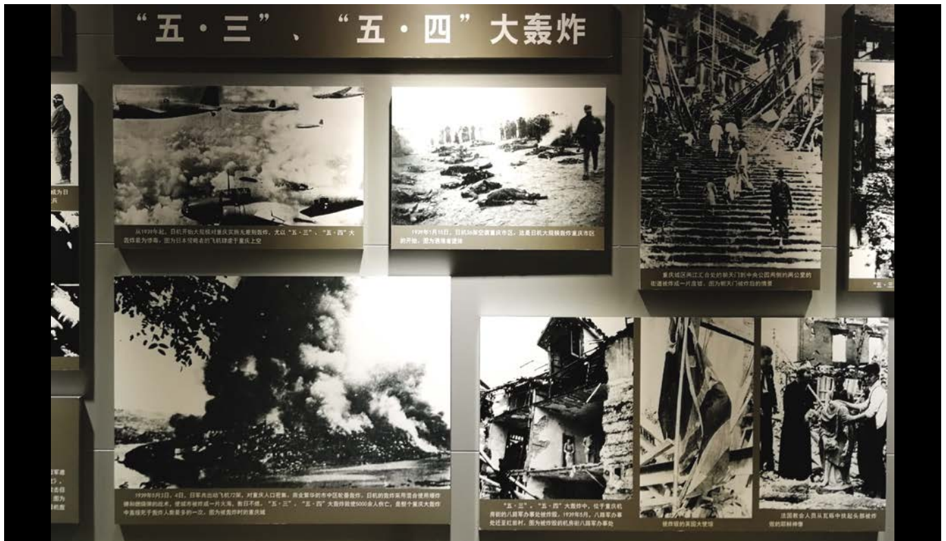
Figure 5. Panel of historic photographs exhibited at the Chongqing China Three Gorges Museum, depicting Chongqing as the ‘City of Perseverance,’ 2018, photo: Vincent Chang.

Recent academic research on historical memory and war remembrance in China has shown how the city-province of Chongqing has succeeded in carving out a unique space within the constantly evolving domestic ‘memoryscape’. 13 Having re-emerged from obscurity during the Mao era, initially as a ‘Red’ revolutionary site, Chongqing has subsequently refashioned itself as the historical centre stage of wartime cooperation between Chiang’s Nationalist government and Mao’s Communist Party, and hence as a rallying site of national unity and strength in the face of foreign aggression. Today, the war exhibition at the Chongqing China Three Gorges Museum – the municipality’s main museum, which welcomes two million visitors annually – depicts Chongqing as the nation’s undefeated ‘City of Perseverance’ and, ultimately, its ‘City of Victory’. This triumphant new reading represents a far cry from the narratives of national humiliation and victimhood often associated with Chinese war memory, and still widely displayed in museums in the regions once occupied by the Japanese (such as Nanjing). Chongqing’s message of heroism, resolve and indomitability aligns neatly with the self-confident, assertive, and more forward-looking central line of war commemoration in Xi Jinping’s China. 14