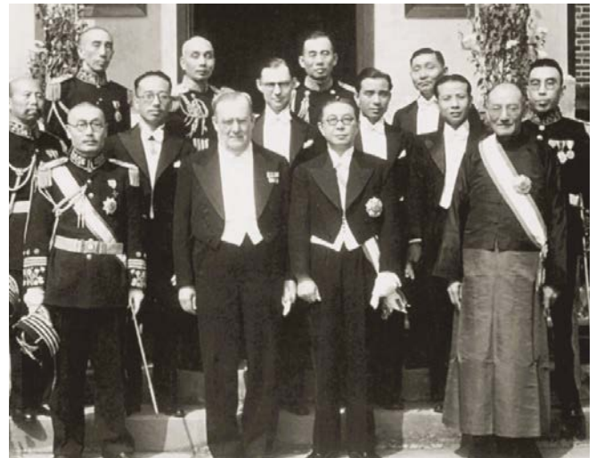
Figure 1. Australian Minister Eggleston poses with Chinese officials after presenting his credentials at Chongqing.

China and Australia should have long ago entered into diplomatic relations, and in view of the present situation in the Pacific, it is imperative for the two countries to exchange diplomatic missions. It is confidently believed that henceforth the friendly relations between China and Australia will be greatly strengthened. 1