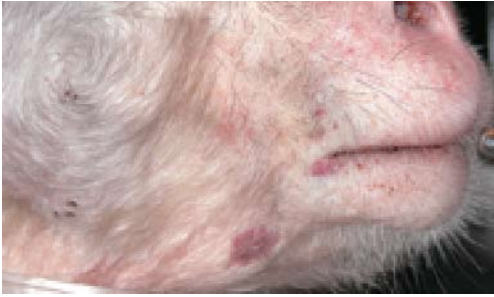
Figure 2. Appearance of the Japanese monkey with ITP.