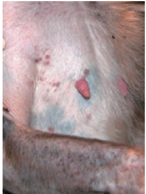
Figure 1. Appearance of the Japanese monkey with ITP.

By 2 weeks after the onset of the symptoms, physical examinations revealed characteristic findings such as mucosal and cutaneous petechiae, ecchymoses and purpura, epistaxis and mucous membrane pallor (Figures 1 & 2). Petechiae were seen in the oral, gingival, nasal and vaginal mucous mem-