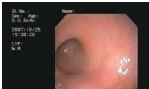
Figure 5. Endoscopic observation of the upper gastrointestinal surface.

Endoscopic observation of the upper gastrointestinal surface is shown in Figure. 5. No upper gastrointestinal lesions including erosion, ulcer and bleeding episode were found.