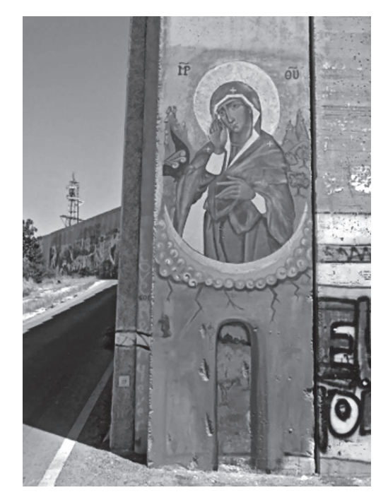
Photo 4. Icon of Our Lady of the Wall painted in 2010 by iconographer Ian Knowles.

The peculiarity of the subject chosen for the icon could refer on the one hand to the Book of Revelation (12:1–5) in which "a pregnant woman clothed with the