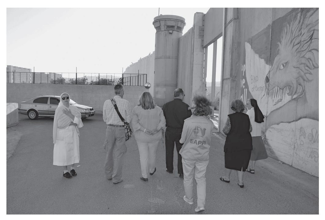
Photo 2. The Elizabethan nuns, Abuna M., an EAPPI volunteer, and Christians recite the Rosary by the Wall next to the entrance of Checkpoint 300. The Checkpoint's watchtower looms over it.

printing, soldiers who check IDs – interconnect with the dimension of the Christian practice of the Rosary recitation. As a result, among the above-cited human and non-human actants, we discover also the presence of praying nuns, pilgrims, rosary beads, the Our Lady of the Wall icon, Hail Maries, Salve Regina , and prayers to achieve the miracle of making the Wall fall. Consequently, the Wall understood and constructed in order to guarantee security to the Israeli inhabitants and experienced as a technology of occupation by the Palestinians, when understood as an assemblage reveals the development of a ritual landscape that is both part of its assemblage and at the same time developed in opposition to its presence.