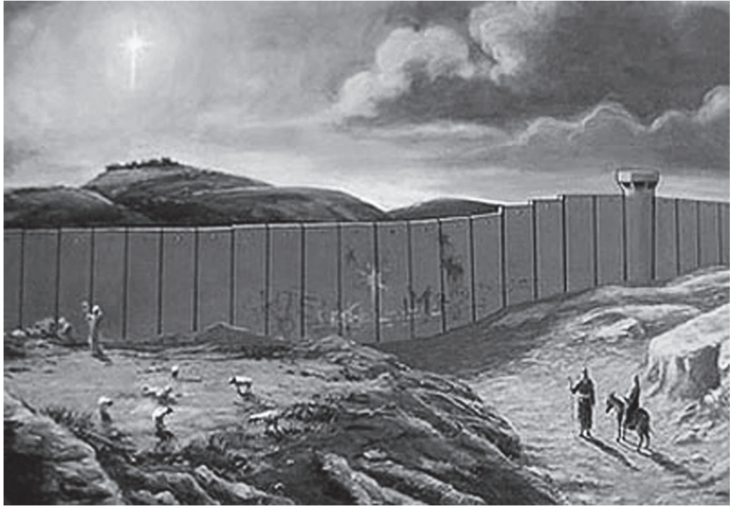
Figure 2. Picture of Mary and Joseph blocked outside Bethlehem by the Wall allegedly painted by graffiti artist Banksy (2015).