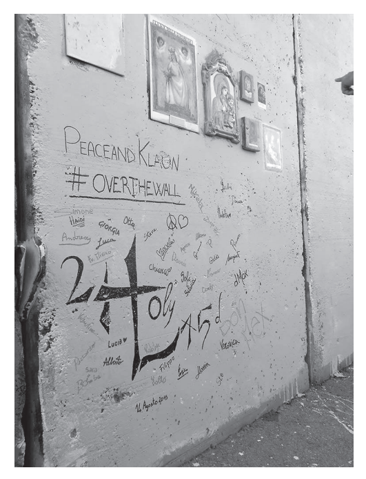
Photo 5. New icons added by Pilgrims next to Our Lady of the Wall.

Noteworthy is the decision to paint the icon directly onto the Wall's surface instead of, for example, nailing or cementing a painting to its slabs as has been done with other icons added at the