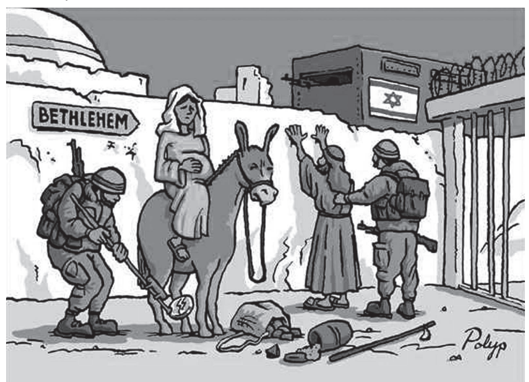
Figure 3. Mary and Joseph inspected at the Checkpoint before entering Bethlehem (Polyp).98 JOURNAL OF ETHNOLOGY AND FOLKLORISTICS 11 (1)