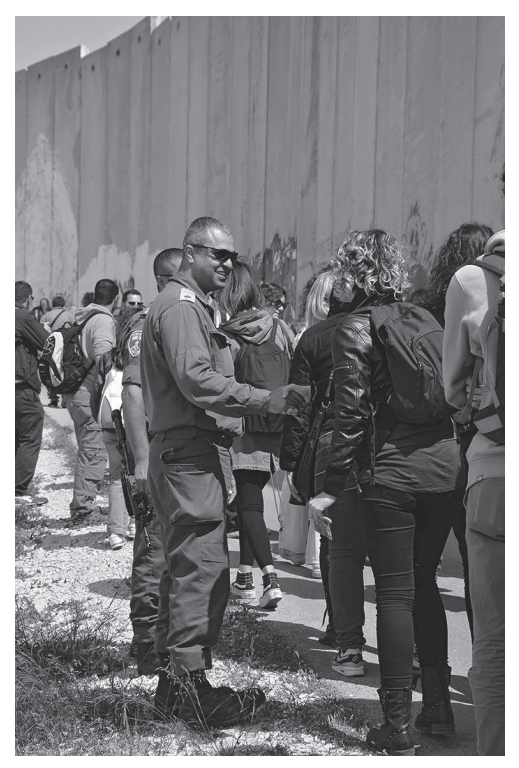
Photo 7. Pilgrims shaking hands with the soldiers monitoring the Holy Mass at Our Lady of the Wall.

at Our Lady of the Wall. As I mentioned above, the religious activities that have sprung from the presence of the icon have become, for the pilgrims who visit Palestine, a way to familiarise themselves with the political situation in this land as well as a solicitation for God's intervention to bring peace and justice. On the morning of April 10, the great number of pilgrims aroused suspicion among the Israeli soldiers guarding Checkpoint 300, and they immediately closed the gate. They followed the pilgrims near the icon and asked the priests for explanations. In response the priests replied that they were not doing anything wrong, that they just wanted to pray at Our Lady of the Wall and they would pray for them as well. The soldiers replied that if they wanted to pray, they would have to do so inside the gates of the monastery of the Emmanuel and not by the Wall. The argument lasted sometime, but in the end the priests agreed just to move