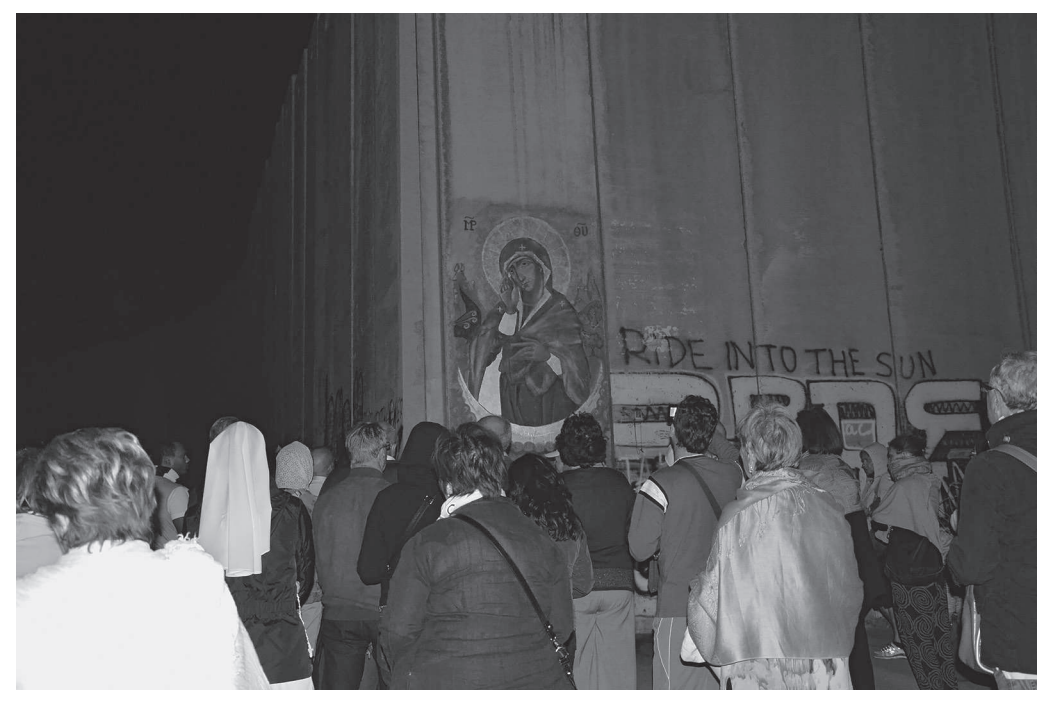
Photo 3. Pilgrims conclude the recitation of the Rosary through the singing of the Salve Regina in Latin while standing in front of the Our Lady of the Wall Icon.

The lack of a strong Palestinian presence is linked to the fact that any type of participation in activities suspected to be connected to political protests or uprisings often leads to the future denial of a permit to enter the State of Israel. Already the Christians benefit from the infrequent permits allotted almost exclusively in conjunction with major religious festivities and any suspicion of political dissent may jeopardise allocation, preventing them from visiting family and friends living on the other side of the Wall.