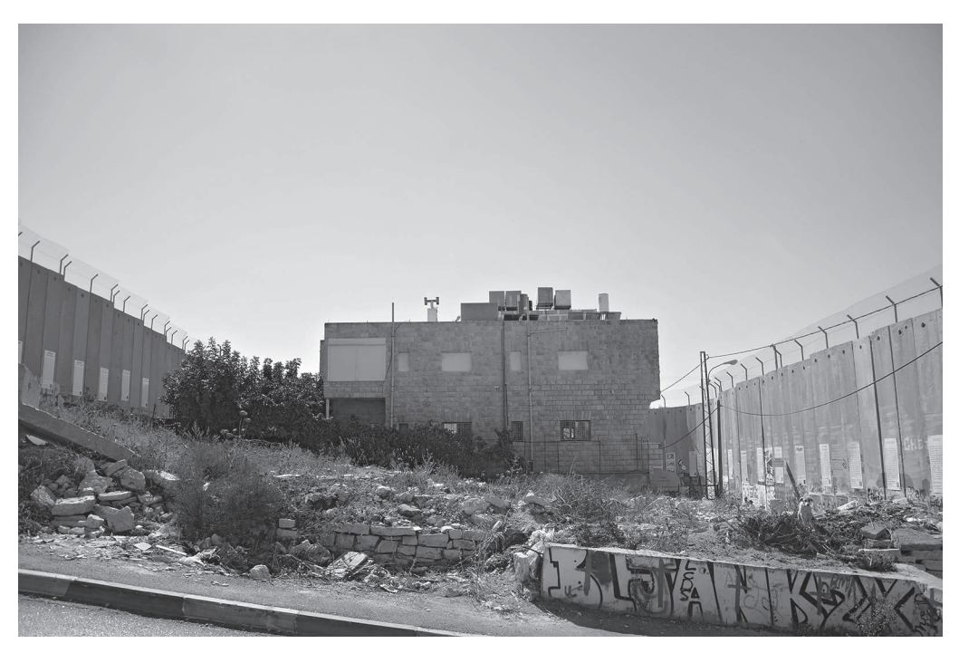
Photo 1. Home of the Anastas family surrounded on three sides by the Wall.

This description provides a few insights onto the importance of incorporating a new materialist interpretative framework through Latour's concept of assemblages. Instead of describing the Wall through adjectives such as 'ugly', 'tall', 'solid', she depicts it as strangling her, that is, she attributes to the Wall an action, that of choking. Already, in this first observation the materiality of the Wall, that is, its physical presence, does not appear inanimate, but she describes it as possessing the same agentic power as a human subject. Secondly, if we acknowledge that the Wall has agency, what does it mean that it strangles someone? After all, the Wall might have been anthropomorphised, but it still does not have actual hands. So what is it about the Wall that strangles?