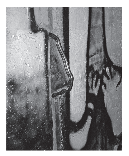
Photo 6. The San Luca Icon pushed in between the Wall's cement slabs near the Icon of Our Lady of the Wall.

we uncover the presence of a ritual landscape that, through a decade of unflinching prayer, has been developing into an actual shrine that is increasingly expanding through the posting of new religious icons. When analysing this particular Wall through the assemblage framework, we do not only realise that it cannot be understood as a mere inert cluster of concrete slabs, but also that because of the agency it exercises on the population, a ritual landscape has developed along its route as a battlefield to voice the dissent of a particular religious group: the Christian minority. In turn, the ritual landscape becomes an integral part of the Wall assemblage. We have seen how its formation gathers both human and nonhuman agency, such as Rosary beads, the colours and symbols adopted in the icon of Our Lady of the Wall, the addition of other Marian icons, the physical presence