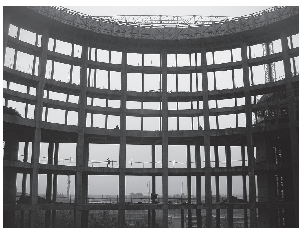
Photo 1. Temple of the Vedic Planetarium under construction.

up to the devotees and depended on their consciousness whether they would perceive those sounds as destructive construction sounds or a pleasing kirtan of a city that was growing for the Lord and his devotees.