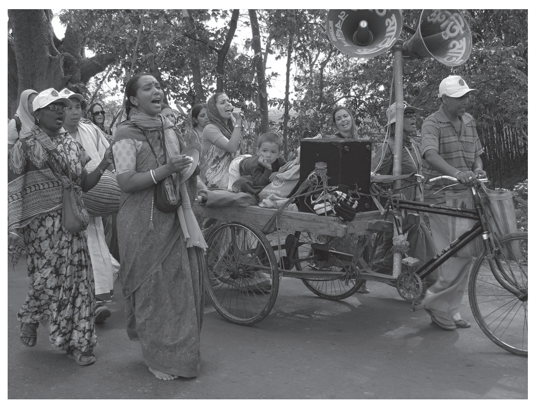
Photo 2. Devotees singing the holy names of God on Parikrama (pilgrimage) in Mayapur.

Mayapur and takes a bath in the Ganges. Devotees believe that those who have purified their consciousness through kirtan and japa can 'uncover' Mayapur and still perceive the presence and mercy of the Lord. This perception enables them to create a very intimate relationship with Krishna – with God who is simultaneously residing in his eternal spiritual sky as well as in Mayapur as Lord Chaitanya.