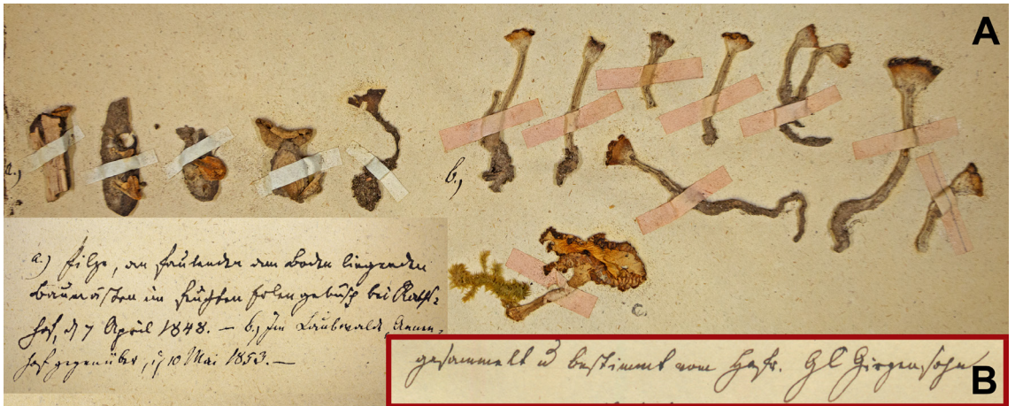
Fig. 2. Example of Girgensohn's collection, sheet no. 24. A: a) Pilze, am faulende am Boden liegende Baumstamm im feuchten gebüsch bei Ratheshof [Fungus on the rotting tree trunk lying on the ground near Raadi, Tartu], d. 7 April 1848 – unidentified discomycetes; b) Im Laubwald, Annenhof gegenüber [In deciduous forest opposite of Annemõisa, Tartu], d. 10 Mai 1853 – Microstoma protractum ; c) unidentified agaric; B (in the red frame): herbarium label written by Girgensohn, no. 119 from Musci frondosi et Hepaticae exsiccatae , TU171695.

using the map compiled by Rücker (1890), the Place Names Database (KNAB, 2001–2020), the German-Estonian place name list (Kongo, 2016) and the Estonian Manors' Portal (Estonian Manors, 1999–2015). To ensure the concordance of toponyms in the text, we added historical names used by Baltic Germans in brackets after the current names in Estonian or Latvian, when first mentioned: e.g., Raadi Manor ( Rathshof ).