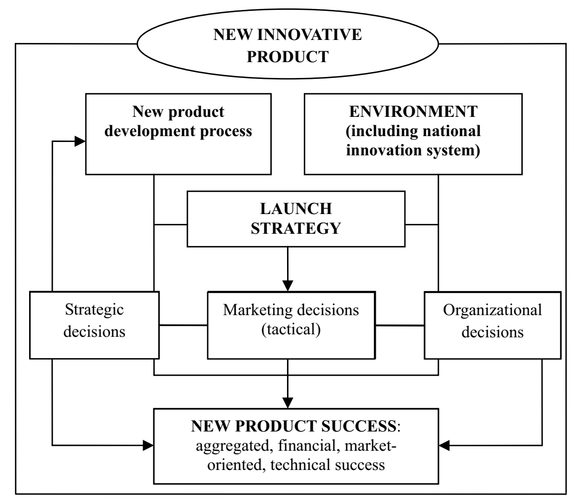
Figure 1. Framework of new product launch success factors.

The specific way of launching new product depends on the launch strategy of the firm. Dundas and Krentler have defined launch strategies as tools to guide new product launches (Trim, Pan 2005). So the launch strategy consists of marketing decisions that are necessary to present a product to its target market and begin to generate income from sales of the new product (Hultink et al. 1997: 245; Garrido-Rubio, Polo-Redondo 2005: 30).