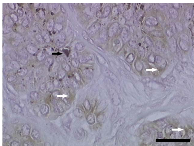
Figure 4. Immunostaining of cytokeratin (AE1/AE3) in the tumor tissue, showing positivity on the neoplastic epithelial cells (white arrows). Black arrow indicates melanin deposits. [Bar = 50 \mu m].

Immunohistochemical studies demonstrated that the neoplastic cells were consistently positive with primary antibodies specific for epithelial cells (cytokeratin (AE1/AE3) [Figure 4], and negative for desmin, vimentin, alpha smooth muscle actin, myoglobin and nestin.