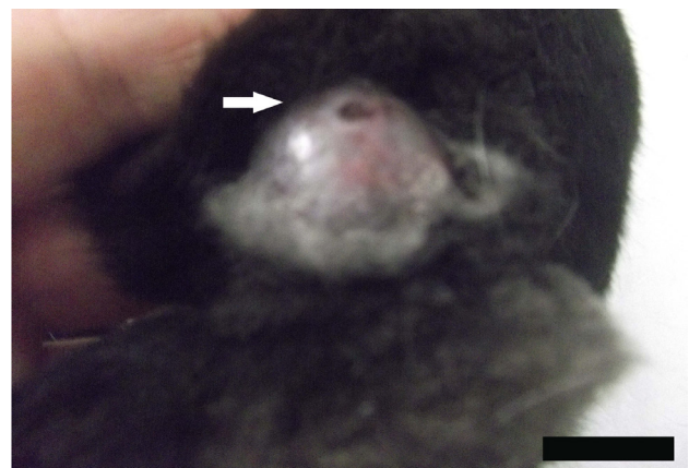
Figure 1. A grayish nodular subcutaneous mass of 3x2 cm anatomically located on left tarsal zone of the left forelimb, showing ulceration (arrow). [Bar = 1 cm].

Macroscopically, there was an ulcerated mass, anatomically located on the tarsal zone of the left forelimb (Figure 1). After excision, no local recurrence or metastasis has been reported so far. Needle aspiration was of good quality and showed a population of basophilic epithelial cells with medium vesicular nuclei, poorly differentiated and sometimes moderately anaplastic morphology reminiscent of the progenitor cells of the epidermis and adnexa along with some evidence of atypia. Histologic examination revealed a solid encapsulated mass of gland-like tumoral nests of basophil isomorphic epithelial cells that showed oval hyperchromatic nuclei, scant cytoplasm, prominent nucleoli, and frequent cellular atypia and mitosis (Figures 2 & 3). These neoplastic cells were separated by interlaced trabecules of connective tissue stroma and basal membrane structures of heavy eosinophilic stain, that led to a diagnosis of malignant trichoblastoma (subtype trabecular).