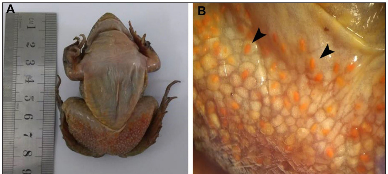
Figure 2. Leptodactylus luctator (Anura: Leptodactylidae) parasitized by Hannemania sp. larvae in the Pampa biome, southern Brazil. A - Ventral view of the anuran, notice the numerous larvae (orange spots) in the hind limbs. B - Detail with magnification of the intradermic parasitic larvae (arrows).