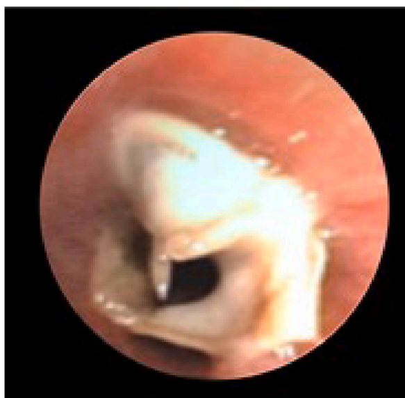
Fig. 1. Bronchoscopy image of inhaled foreign body (cuttlefish) in the left lower lobe with granulation tissue formed.

Delayed diagnosis and retrieval of FB have been correlated with greater rates of major complications [5]. Bronchoscopy should