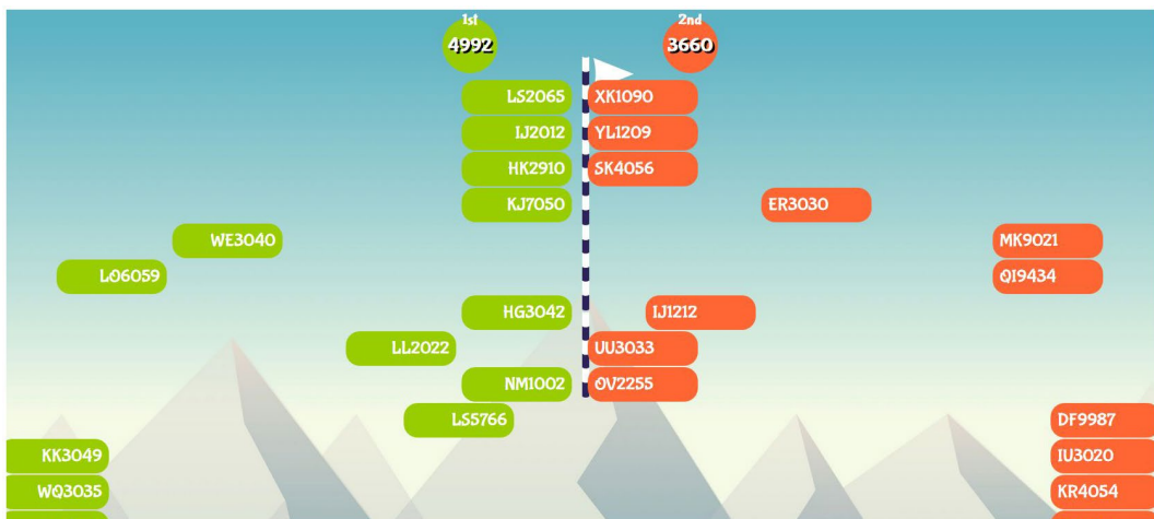
Figure 1: Presentation screen for the gamification group. Screenshot from Quizalize ( https://www.quizalize.com/ ) [Colour figure can be viewed at wileyonlinelibrary.com ]

Declarative prior knowledge was assessed via two multiple choice questions referring to a crucial aspect for both topics of the lecture, namely assessment and feedback. An example item for feedback is: “What is the difference between knowledge of result (KOR) and knowledge of correct result (KCR) feedback?”. The mean of these two items was calculated to create the variable prior declarative knowledge .