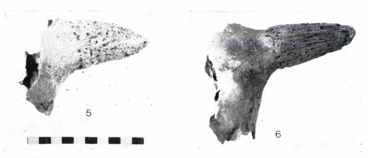
Fig. 4. Horn-core fragments of domestic cattle (1-2, primigenius \ type; 3, brachyceros \ type Fig. 5. Brain-skull fragment of domestic cattle of brachyceros type Fig. 6. Brain-skull fragment of domestic cattle of brachyceros type