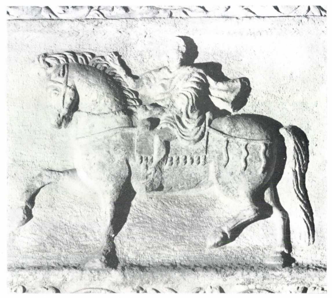
Fig. 12. Representation of a large Roman horse on a tombstone from Scarbantia

(see Table 1 ) that could give direct data concerning the size (withers height) and constitution ("Wuchsform") of the Roman horses of Scarbantia. In fact all four long bones came from adult or even mature animals that already reached their full size and body proportions.