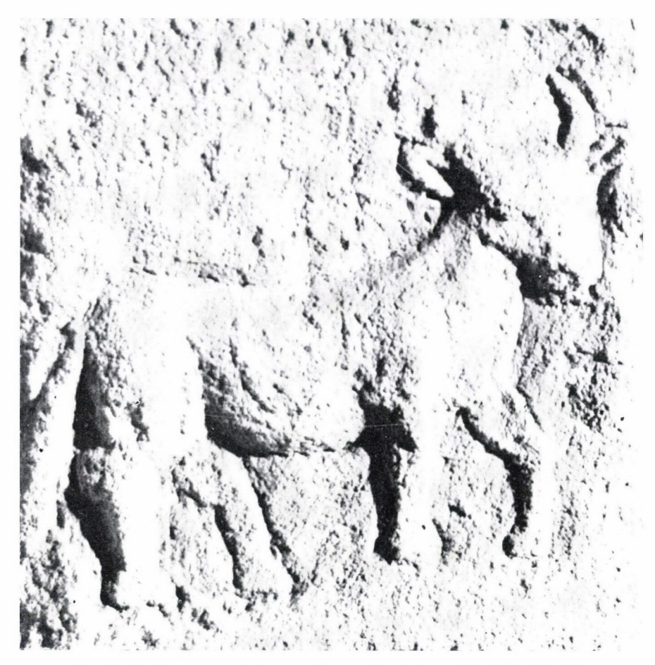
Fig. 7. Cattle representation on Roman tombstone from Scarbantia

As regards the frequencies of the three above groups the first is represented by 9, the second by 6, and the third by 3 skull and horn-core fragments respectively.