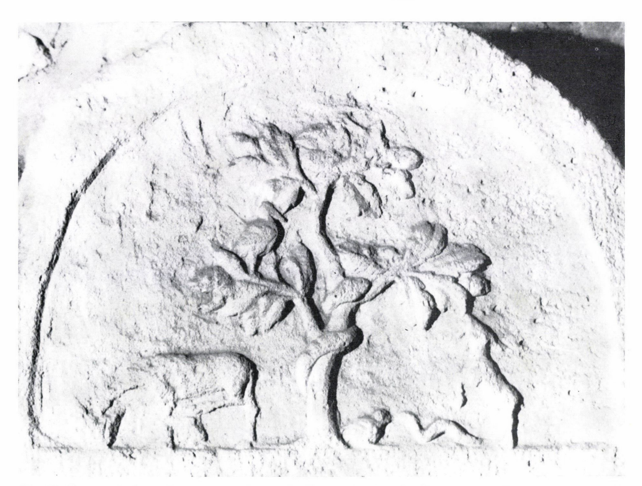
Fig. 11. Representations of goats, one of them feeding on the branch of a tree, on a Roman tombstone of Scarbantia

portion was 3.25 sows to a boar<sup>39</sup> and other sites of the Roman provinces (except some with small bone samples) also showed similar ratios.