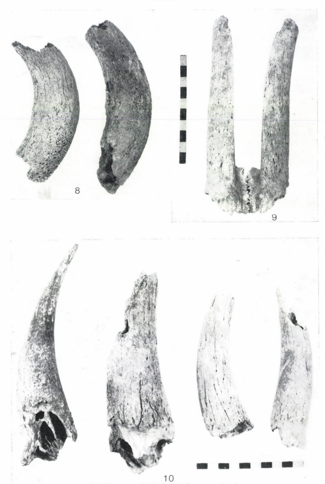
Fig. 8. Horn-core fragments of "copper" sheep Fig. 9. Brain-skull fragment with both horn-cores of a goat Fig. 10. Horn-core fragments of goats