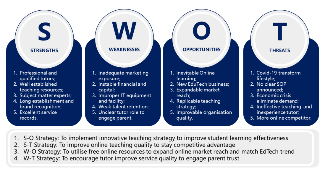
Figure 1.2 SWOT analysis of Pusat Tuisyen Seri Minda Muda