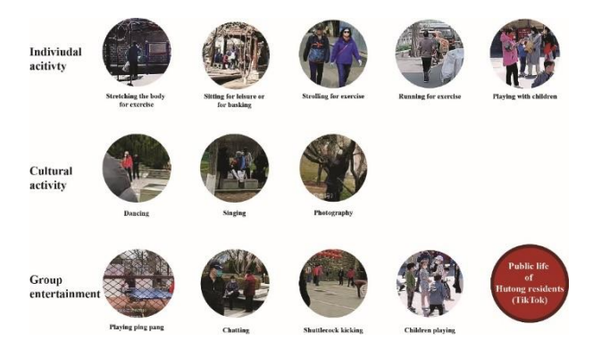
Figure 6. The contents of Hutong residents' public lives happened outside Hutong from TikTok

By comparing Figure 3(a) and Figure 3(b), The more keywords in Figure 3(b) show that TikTok live streaming can reveal more content than field research. Watching TikTok live to collect data is more accessible than fieldwork. The researcher needs to watch their phones and take screenshots of important moments. The time to collect the data equals the time to watch the live streaming that the researcher does not need to waste part of their time running around like fieldwork. Solving the conflicts arising from previous studies and field research has further demonstrated the advantages of watching TikTok live stream.