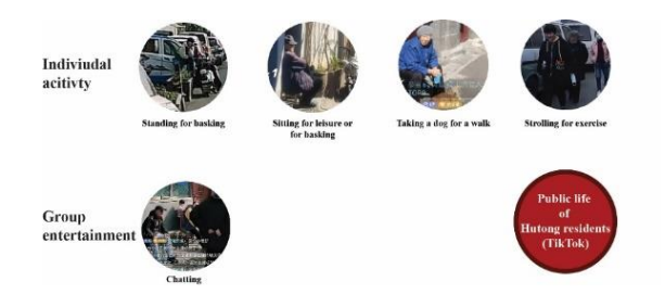
Figure 5. The contents of Hutong residents' public lives from TikTok

There are 510 screenshots of TikTok live streaming Hutong residents' activities in the public space of Hutong. The researchers described the behavior of the Hutong residents in each screenshot and conducted a thematic analysis of the descriptions. Figure 5 shows that the activities observed by TikTok live streaming were summarized into the categories obtained from the field research. However, the researcher found no cultural activities watching TikTok live streaming. Cultural activities in Hutong are organized by the community in a particular room of Hutong [46]. The schedule of each activity would be announced on the Hutong community's social media, but most people are unaware of these cultural activities. Hence, even though anchor Y and anchor A are Hutong residents with long living experiences, it is hard for them to show the data about these cultural activities. The absence of cultural activities cannot prove that field research is irreplaceable. The researcher has found the social media of Nanluogu Xiang, which is a platform to inform the situation of the cultural activities. Anyone can read the information on this platform, including non-Hutong residents. In other words, researchers who watch TikTok live streaming for data collection can make up for data deficiencies through documentation.