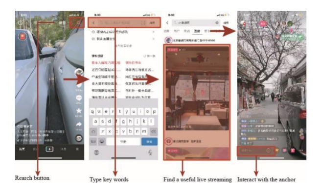
Figure 1. The interface of TikTok live stream

online, and the products they sell relate to their showing talent. In order to give audiences a more profound experience of products, some anchors will try their products by themselves, especially those who are selling discounts on restaurants, bars, or hotels. Following these anchors, the audience can experience the local life of their place. It could also be a new way to replace field research for data collection.