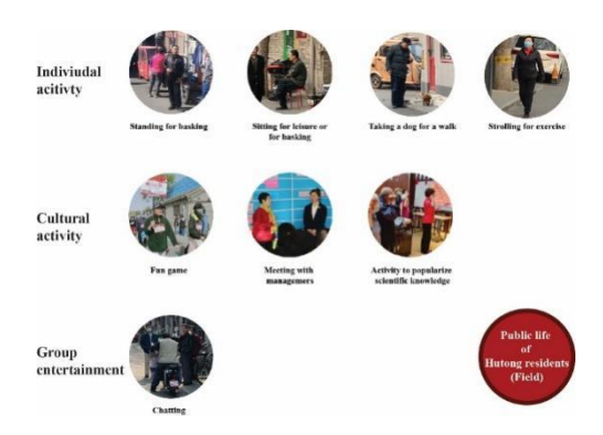
Figure 4. The contents of Hutong residents' public lives from field research

simplify the public lives of Hutong residents into individual activity, group entertainment, and cultural activity. Figure 4 shows detail of Hutong residents' public lives. The individual activities include standing for basking, sitting for leisure or basking, taking a dog for a walk, and strolling for exercise; the cultural activities are fun games, meeting with managers, and popularizing scientific knowledge; and the group entertainment is only chatting. Figure 3(a) shows that strolling for exercise is the most frequent public life for Hutong residents, then, in turn, standing for basking, sitting for leisure, or basking and chatting.