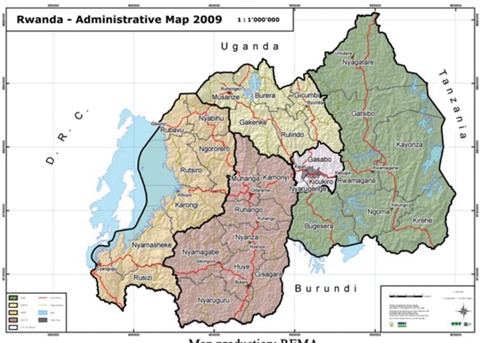
Map production: REMA