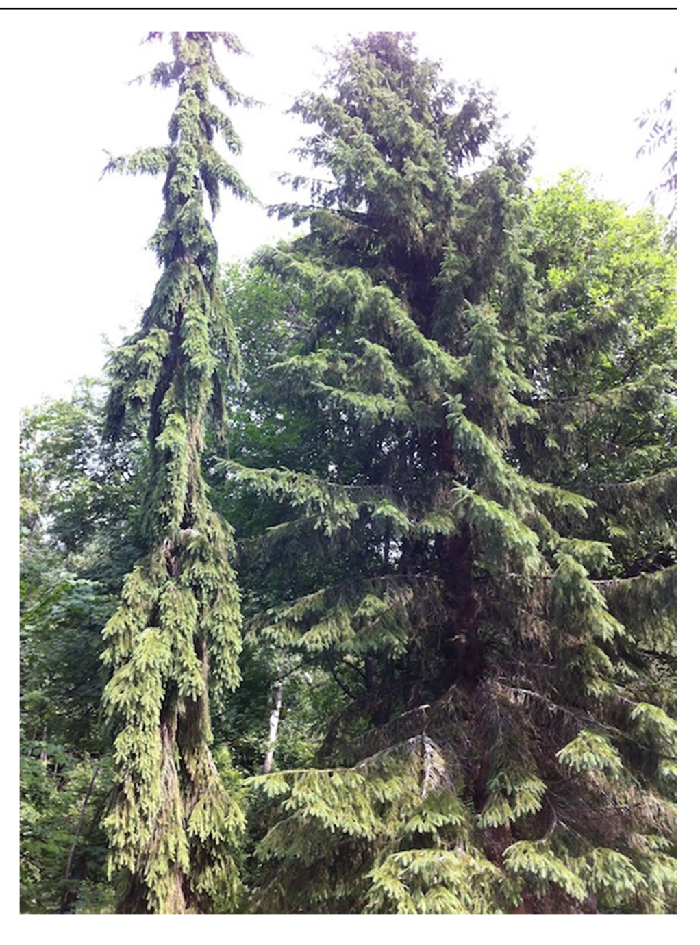
Fig. 1 Pendula (left) and regular (right) Norway spruce trees. Photo taken at Arboretum Norr in Umeå, Sweden.

and Pulkkinen 1990; Pulkkinen and Poykko 1990). They also appear to be less sensitive to tree competition than normal-crowned individuals (Gerendiain et al. 2008), which suggests that they can be planted in denser stands. This mutant also appears to segregate in a 1:1 dominant segregation pattern consistent with the control of one or only a few genes with no intermediate phenotype (Karki and Tigerstedt 1985; Lepistö, 1985). However, in order to utilize the Pendula mutant in practical forestry and silviculture, a method for screening the branch phenotype at an early age is necessary. This could be done with a reliable genetic marker. An earlier study aimed at identifying such a marker was