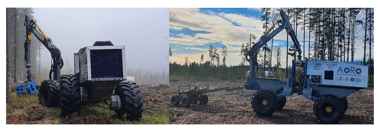
Fig. 3. The Arctic Off-Road Vehicle Platform (AORO). Autonomous tests of inverse scarification to the left (a) and forwarding demonstration to the right (b). AORO is developed in collaboration initiative between Luleå University of Technology, Swedish University of Agricultural Sciences and The Cluster of Forest Technology.

(Cronartium flaccidum) that is spreading in many places in northern Sweden and Finland, should be removed as well to stop the infection. Doing all this also during the wintertime, when it is dark and trees are partly covered with snow, is a humanly impossible task. With the help of machine vision and automated object identification a harvester can have a 360° vision all the time that, with the help of AI and robotics, can operate the harvester to harvest trees with predefined specifications. Having this sensing capability, preceding undergrowth clearing, commonly done to help thinning operators to work efficiently, could be avoided. For example, research shows that between 10 and 70 % of penetration can be achieved with Lidar data (Chevalier et al. 2007). Consequently, when undergrowth is kept after thinning, other forestry methods such as continuous cover forestry are not disabled.