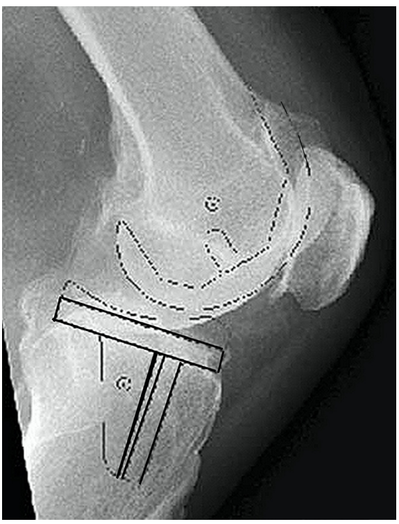
Figure 5: Preoperative templating radiograph of a osteoarthritic knee joint.