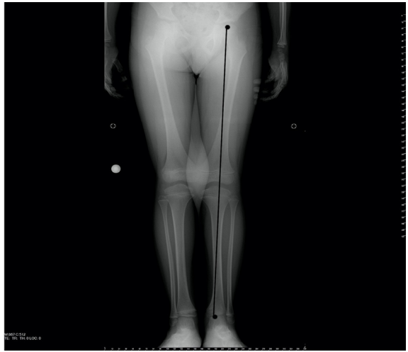
Figure 3: Standing anteroposterior radiograph of the lower leg shows lower limb mechanical axis.