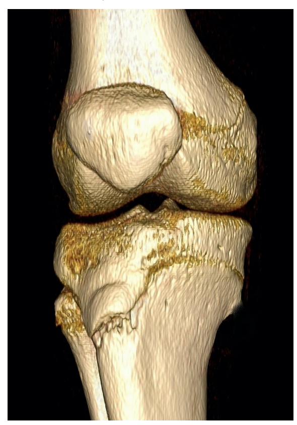
Figure 6: Three-dimensional computed tomography examination of the knee joint using volume rendering technique.

to the knee. They also allow for the determination of the sizes and locations of the osteophytes that need to be removed while reconstructing the anatomical contours of the knee during surgical procedure.<sup>11</sup>