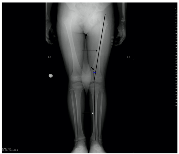
Figure 1: Standing anteroposterior radiograph of the lower leg shows the femorotibial angle (short black arrow) which is between the femoral (long black arrow) and tibial (long white arrow) anatomical axes.