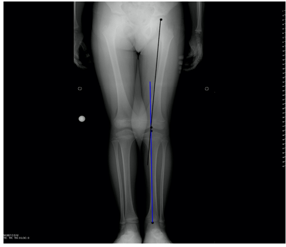
Figure 2: Standing anteroposterior radiograph of the lower leg shows the hip-knee-ankle angle formed between femoral (black line) and tibial mechanical axes (blue line).