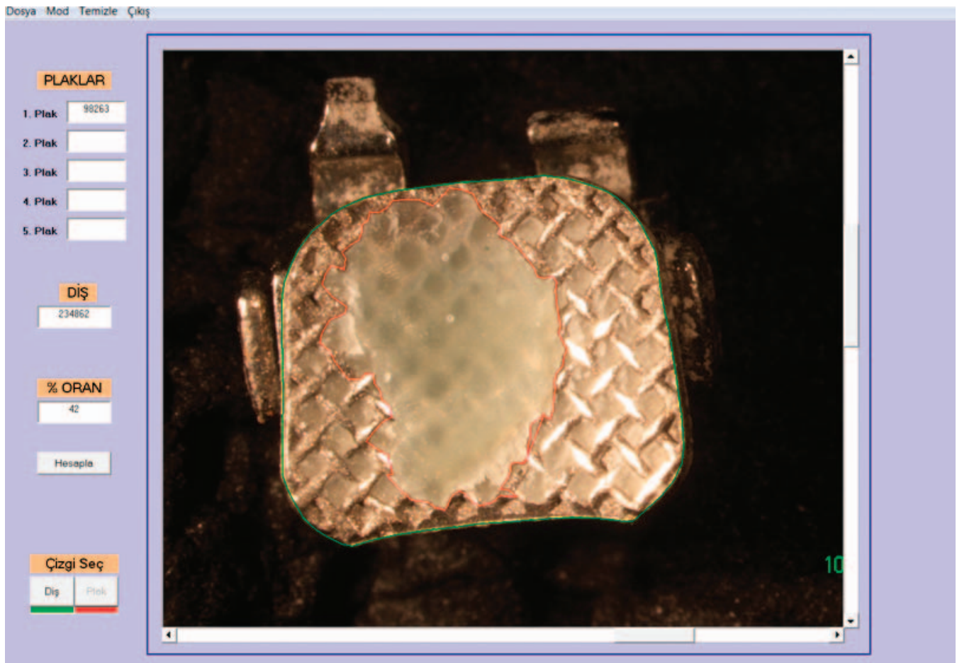
Figure 1. Measurement of percentage adhesive remnant area with digitized computerized image analysis system.

pared with the naked eye evaluation ( p \leq 0.05 ). On the other hand, there was no statistically significant difference between the image program and the \times 20 magnifications according to the three researchers in this study (S.A., S.Y., and A.O.).