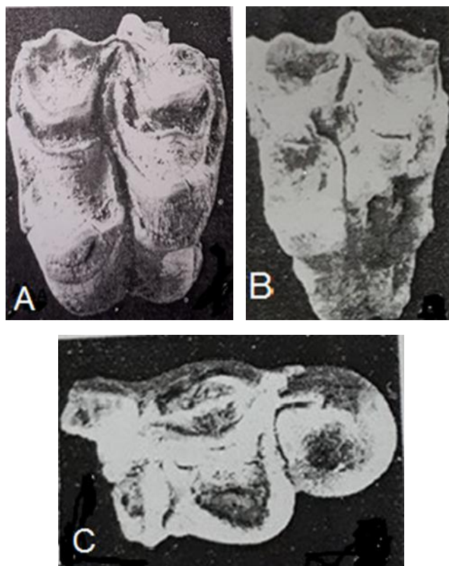
Plate 1: Occlusal views for Samotherium cf. boissieri . (A) worn left M2. Palaeotragus coelophrys; (B) left M1; (C) left M3. (modified after Thomas et al. , 1981)

occurrence of a natural external effect led to the mass mortality of the population during Pliocene.