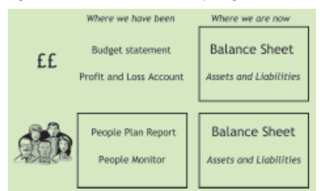
Figure 1 shows how that balance can be in practice. The finance profit and loss statement is a statement of what has happened over a period, usually compared with a plan called the budget. Likewise we can make a plan for our people resource, and report on how we are doing against it. The People Balance Sheet will not be in financial numbers (though there may be a few) but will be a statement of what is in positive territory, and what is negative and therefore requiring attention.

A third purpose of people-related measures is about the effectiveness of the HR functional contribution, which we discuss further below.