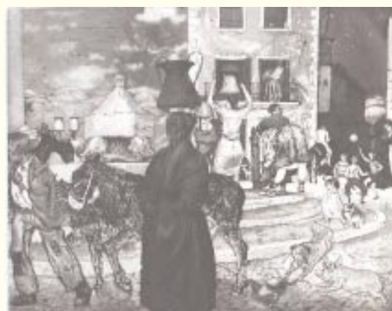
right Piazza Anticoli , etching/aquatint, 1956