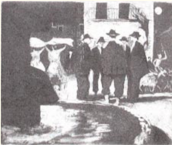
left Winter, wood gatherers, Anticoli, Italy , etching and aquatint, 1978

Haunting etchings such as Winter, wood gatherers, Anticoli, Italy , 1978, display particularly strong resonances of Palmer. In this work a lone figure, viewed from behind in the dark of a silent wood, loads sticks onto the pannier of a donkey while a wild pig roots at his feet; in the distance, picked out in dusky twilight, is another solitary figure set against the background of a gently rounded Palmer-esque hill. Another tiny but highly atmospheric etching of the same year, 'Evening Natter', Anticoli, Italy combines elements of Palmer and Calvert with its luminous moonlit view of a darkly shuttered house before which is a charming vignette, seemingly, of the satyr Pan and an anonymous dark companion, herding a flock of goats along a path. In the foreground is a more prosaic but no less intriguing view of five men in Homburg hats, huddled in intimate conversation, whilst two sturdy women pass by 'taking unleavened bread to be baked in the village's communal oven' (as Fozard explains in a pencil note beneath the image).