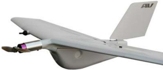
Figure 10. AeroVironment's Wasp III.

Since the wars in Afghanistan and Iraq began in 2001 and 2003 respectively, the world has witnessed an increasing number of unmanned aerial vehicles entering the battlefield. To date, these number in the low thousands. The current batch of small man-portable drones almost entirely consists of fixed winged systems such as the Lockheed Martin Desert Hawk III and the AeroVironment Wasp III. However, these are beginning to be supplemented by VTOL UAVs which can hover and stare, such as the Honeywell T-Hawk system, which is just about to enter service with the US and UK armed forces.