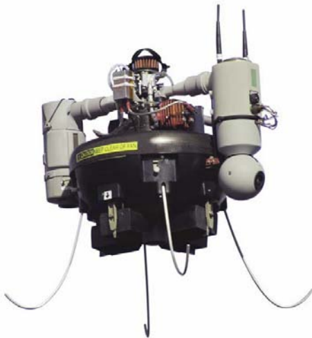
Figure 11. T-Hawk MAV from Honeywell Inc.

The T-Hawk system consists of two UAVs together with a Ground Control Station (GCS). In Feb 2009, it was reported that the UK MoD had placed a US$5.7m order to buy six of these systems for use in frontline operations. The US Navy placed an order for 90 systems worth US$65m in Nov 2008.