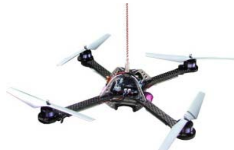
Figure 2. AscTec's Hummingbird.