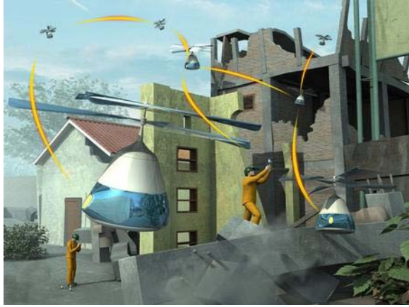
Figure 12. The muFly vision of future NAVs.

The US Government's NAV R&D effort is being driven by DARPA [6] who are funding work at AeroVironment Inc. The Harvard group is being funded via a US$10m National Science Foundation research grant over the next five years [7].