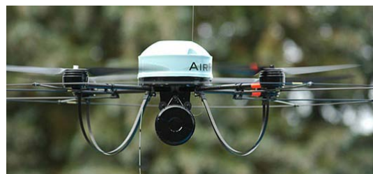
Figure 3. AirRobot's AR100-B.