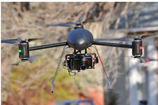
Figure 6. Draganflyer X6 co-axial tri-rotor.