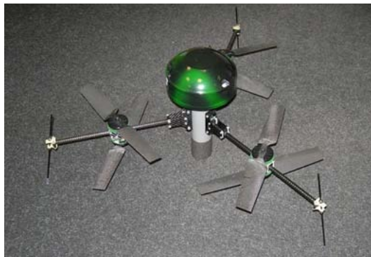
Figure 5. AirRobot's AR70 co-axial tri-rotor.