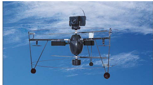
Figure 1. EMT-Penzberg's Fancopter.

Ascending Technologies (AscTec) and Middlesex University have been developing multiple rotary-winged UAVs (more than one rotor) and these are now starting to enter the military and civilian markets with great success.