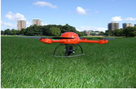
Figure 4. Microdrones' md4-200.