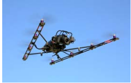
Figure 8. AscTec's Falcon 8.