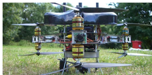
Figure 7. Middlesex University's co-axial tri-rotor.