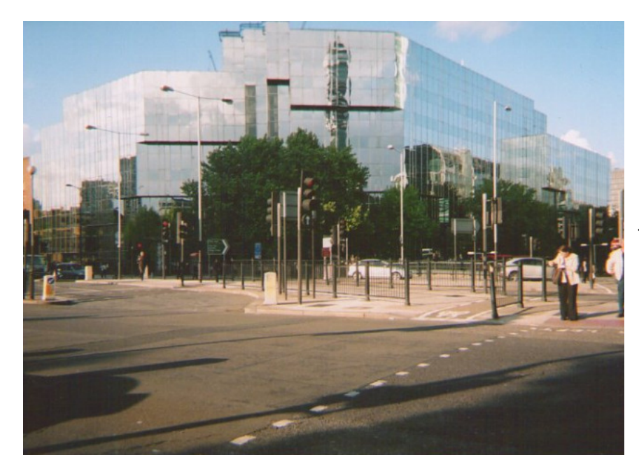
This is where I came for my driving lesson, my first driving lesson. I remember that one. There are many crossings. It is hard. There are different lanes. It is good how they built it, but you have to be attentive.