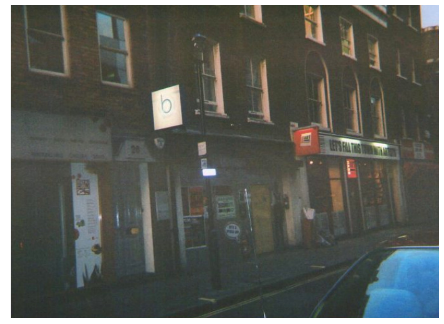
This is Berwick Street hostel. The first hostel I stayed. I spent 28 days. This was very dangerous. There were people fighting, all the time, they had knives. You could not sleep at all. It wasn't good at all.