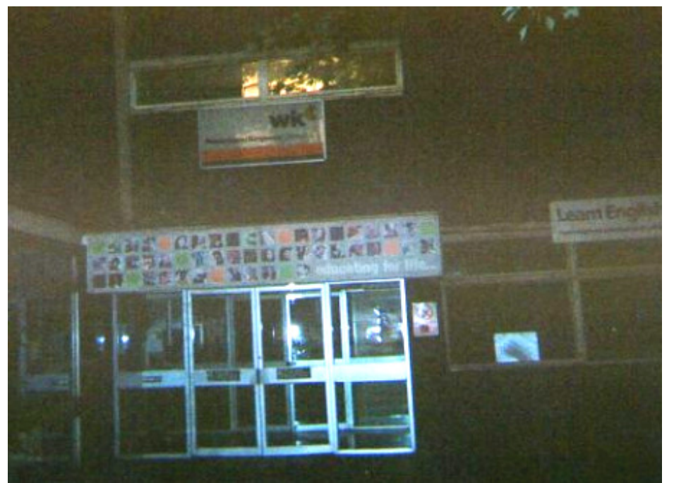
This is Westminster Kingsbury College. This is the first college I went to learn English, when I came into this country. I could not speak English. This is where I came that summer.