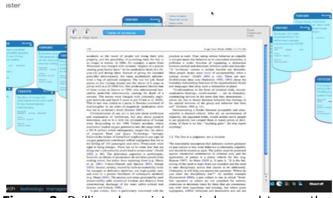
Figure 2. Drilling down into an index card to see the content of the document.

Each set of search results are grouped into a cluster. The infinite canvas allows users to visualize multiple searches (or clusters) simultaneously (see Figure 3). This is a step away from traditional tabbed-browsing,