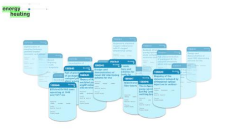
Figure 4. The merging of two clusters.

Users are also able to extract index cards of interest from across clusters to make a new user-defined cluster. This is done by drawing a continuous line that passes through each of the interested index cards. When the user stops drawing, the selected index cards are merged into a new cluster. We call this method connecting the dots , which is a gesture that translates well between both cursor and touch based interactions (see Figure 5).