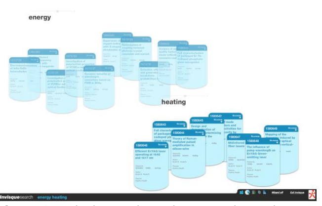
Figure 3 . Multiple search results grouped into clusters. The active cluster (the focus) is opaque while remaining clusters (the context) are semi-transparent, layering the information presented to the user.

and allows users to make visual comparisons between multiple search results.