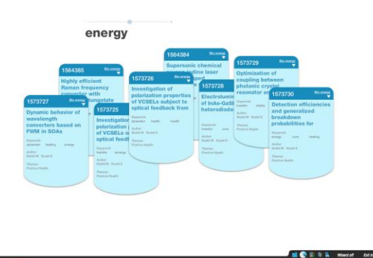
Figure 1 . Search results screen showing 'index cards' with bibliographic information.

By clicking on an index card, users are able drill down to find more information. In the case of a document search, users can view the content of the document (see Figure 2). If searching for films, then users could drill down to read a synopsis or watch a trailer. INVISQUE is designed such that the information appears in the foreground, meaning the user never leaves the workspace. This helps to maintain the context of the search.