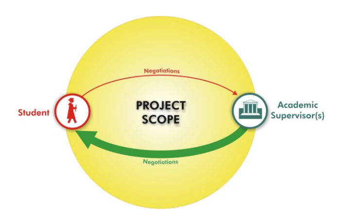
FIGURE 1 ACADEMY-BASED PROJECTS, SIMPLIFIED INTERACTION MODEL BETWEEN A STUDENT AND AN ACADEMIC SUPERVISOR