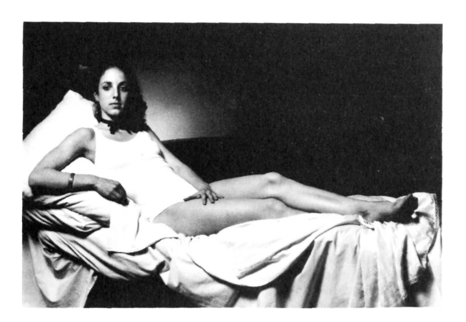
Victor Burgin: from Olympia (1982).

A number of things should be noted about the explosion of a multiplicity of new artistic forms in the late 1960s and early 1970s. In the first place, there