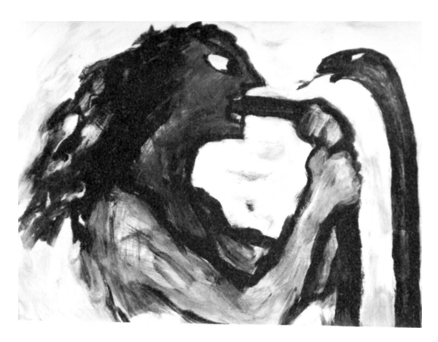
Alexis Hunter, Considering Theory, 1982

gap between these two equally unsatisfactory alternatives. Yet, as it stands, this idea remains as theoretically eclectic as the art which it pertains to comprehend is aesthetically hybrid; more of a symptom of the limits of a certain discourse on modernism than a resolution to the problem of its continuing applicability.<sup>24</sup>