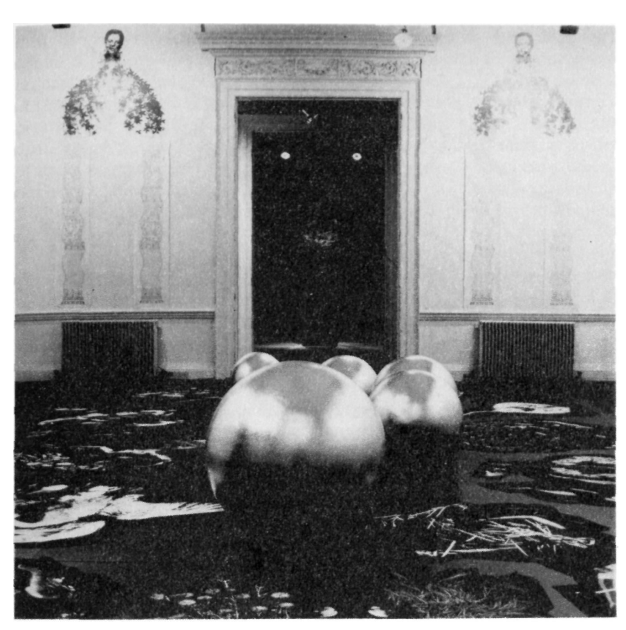
Helen Chadwick: Of Mutability. Installation, view of the 'Oval Court' and 'Carcass', ICA London.

growing tendency to reject Adorno's work as historically outmoded in much the same way as Greenberg's work has been attacked since the mid-1960s. Implicit in these attacks is the notion that the two theories are involved in essentially the same kind of defence of an outmoded modernism. It is this idea that I am concerned to oppose. Adorno's aesthetics, I shall suggest, stands to Greenberg's as 'traditional' stands to 'critical' theory. ^{28} Its whole rationale is to overcome precisely that 'one-sidedness that necessarily arises when limited intellectual processes are detached from their matrix in the total activity of society', which, according to Horkheimer, is a defining characteristic of all 'traditional' theory, 29 and which is so evident a feature of the traditionalism of Greenberg's conception of aesthetic experience. This relation is to be seen at its clearest in a comparison of Greenberg's and Adorno's conceptions, first, of the idea of the autonomy of the art work; second, of that of its aesthetic medium or, in Adorno's case, its 'artistic material'; and finally in their respective conceptions of the relationship of modernism to tradition, and to the idea of the avant-garde.